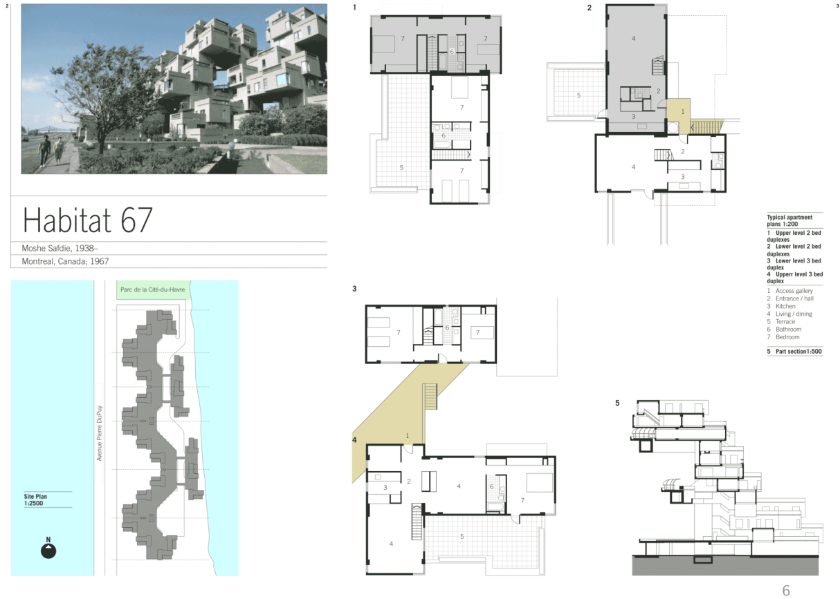
Fig 3. Extract from Key Urban Housing of the Twentieth Century: Plans sections and elevations Laurence King (UK) Norton (USA) 2009. Chapter 4 Alternatives, page 134.