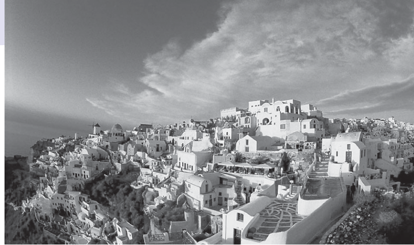
Oia, Santorini, Greece