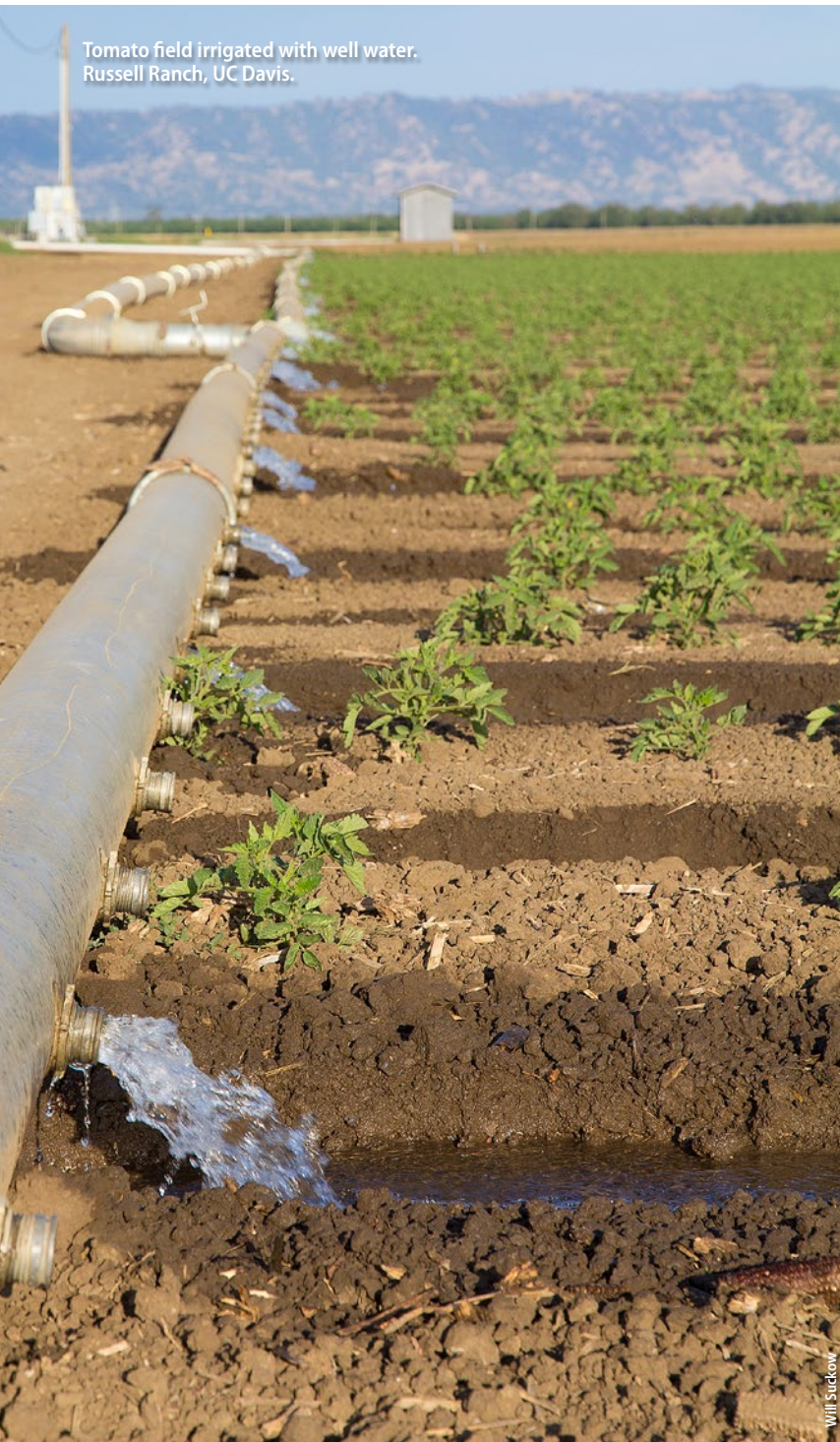
Tomato field irrigated with well water. Russell Ranch, UC Davis.