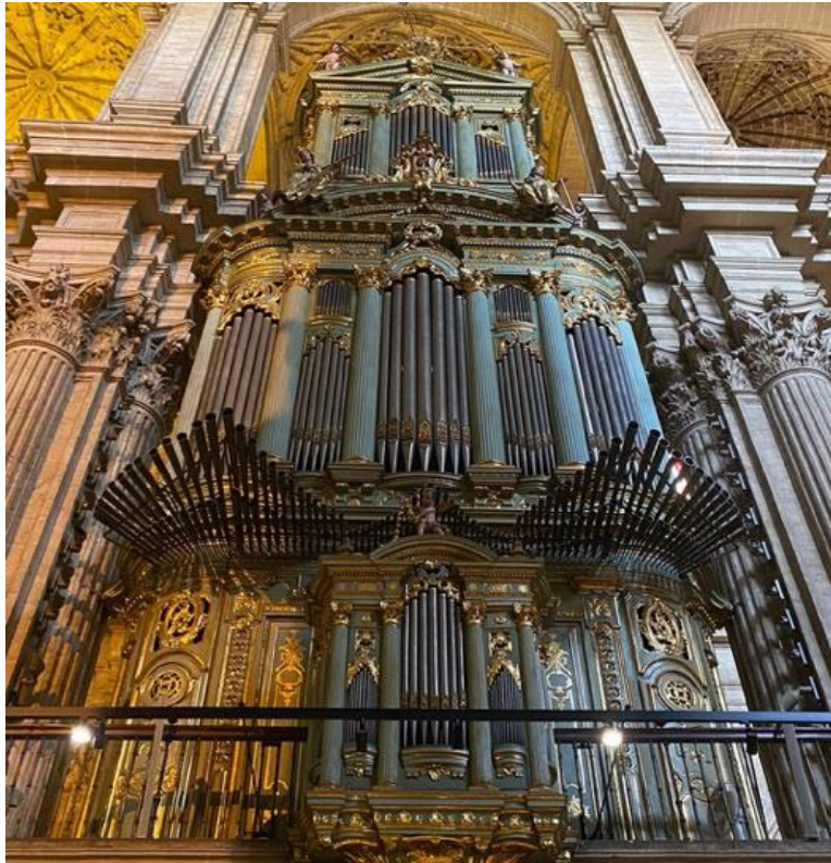
Malaga Cathedral organ, Málaga, Spain.

advantageous, but also, the organ was part of the ritual itself, its central position corresponds to the fact that music in cathedrals was not a secondary element but something fundamental.