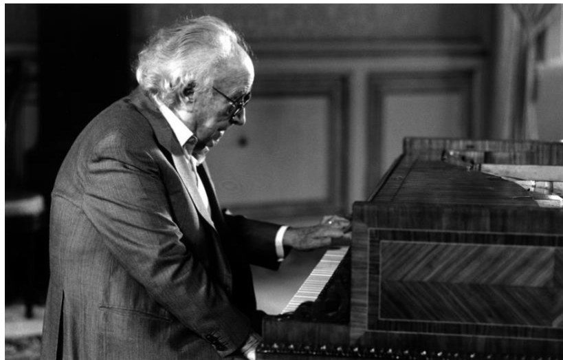
Spanish composer Joaquín Rodrigo.

The old house, narrow, the typical spiral staircase, a very modest floor, a small workroom and in it an old piano, some mats, a fireplace that was not very warm and many, many scores and a large number of books. At that moment, I became acquainted with his French, a French that took me months to understand, through his beard and through an opaque, almost hoarse voice. 3