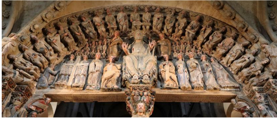
Pórtico de la Gloria, Santiago de Compostela Cathedral, Santiago de Compostela, Spain.

There are transcendental architectural spaces for the history of music. The first auditoriums burst into Greek culture with the odeons, created especially for singing competitions. According to Vitruvius, they were built with large basins under the floor to favor good acoustics. In their construction, hearing was more important than sight. The majestic Portico de la Gloria of the cathedral of Santiago de Compostela leaves us a magnificent organological inventory, a unique testimony to know how the ancient instruments were and how they were played. And from a Paleolithic cave, that of the Trois Frères in the French Ariège, comes the first musical representation known today. Dating back to 13000 BC, it shows a bison-man, a character known as the “little magician,” playing a nose flute.