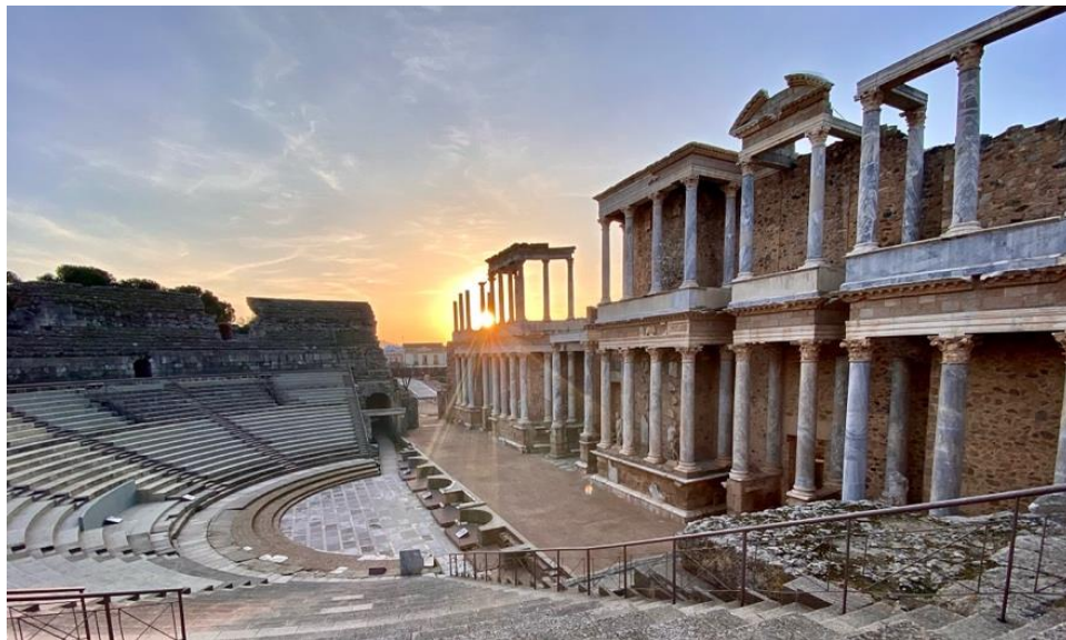
Teatro de Mérida, Mérida, Spain.

There are transcendental architectural spaces for the history of music. The first auditoriums burst into Greek culture with the odeons, created especially for singing competitions. According to Vitruvius, they were built with large basins under the floor to favor good acoustics. In their construction, hearing was more important than sight. The majestic Portico de la Gloria of the cathedral of Santiago de Compostela leaves us a magnificent organological inventory, a unique testimony to know how the ancient instruments were and how they were played. And from a Paleolithic cave, that of the Trois Frères in the French Ariège, comes the first musical representation known today. Dating back to 13000 BC, it shows a bison-man, a character known as the “little magician,” playing a nose flute.