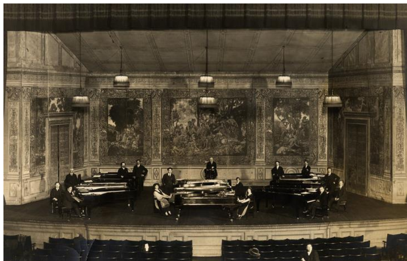
Moszkowski Testimonial Concert, December 21, 1921. Carnegie Hall, New York City.

The efficient construction of theaters and auditoriums has been a constant concern since the Renaissance. Domes were particularly problematic, as they did not distribute sound well enough to concentrate it in a single focus. On the other hand, sight and hearing are equally involved in the building. The architect who designs an auditorium is confronted with acoustic problems, especially those arising from reverberation, but also with visual problems; he must provide good viewing angles. When Garnier drew up the plans for the Paris Opera, he realized that the social as well as the musical character prevailed; the public not only went to the opera to listen, but also wanted to see and be seen. That is why the passageways became as important as the stage itself. Similarly, the Sydney Opera House or the Casa da Música in Porto delight us both acoustically and visually.