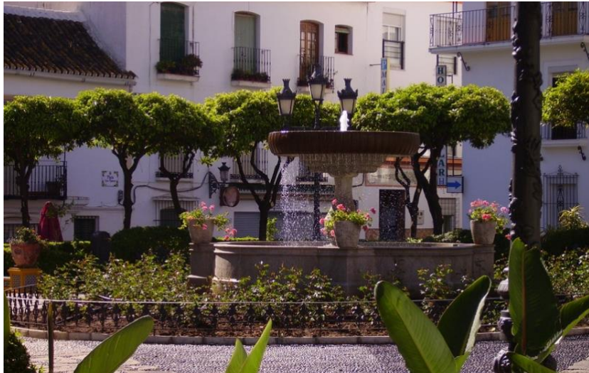
La plaza de las flores de Estepona, Málaga, Spain.

It would seem a trivial, unimportant example, were it not for the fact that this description comes from a blind man who has been blind since he was three years old. He speaks of narrow staircases or an opaque voice, how is it possible for a blind person to perceive such visual parameters? Actually, it is possible to hear architecture. Blind people have a much more developed sense of hearing and can detect the proximity or distance of objects by the echo of their footsteps. Virtually all architectural spaces project sound in one way or another, and Rodrigo simply used his hearing to perceive the place. In addition, the great Saguntino surprises us with music for ballet or cinema, and also with his extraordinary Concierto de Aranjuez , undoubtedly the best sound portrait of the city of Madrid.