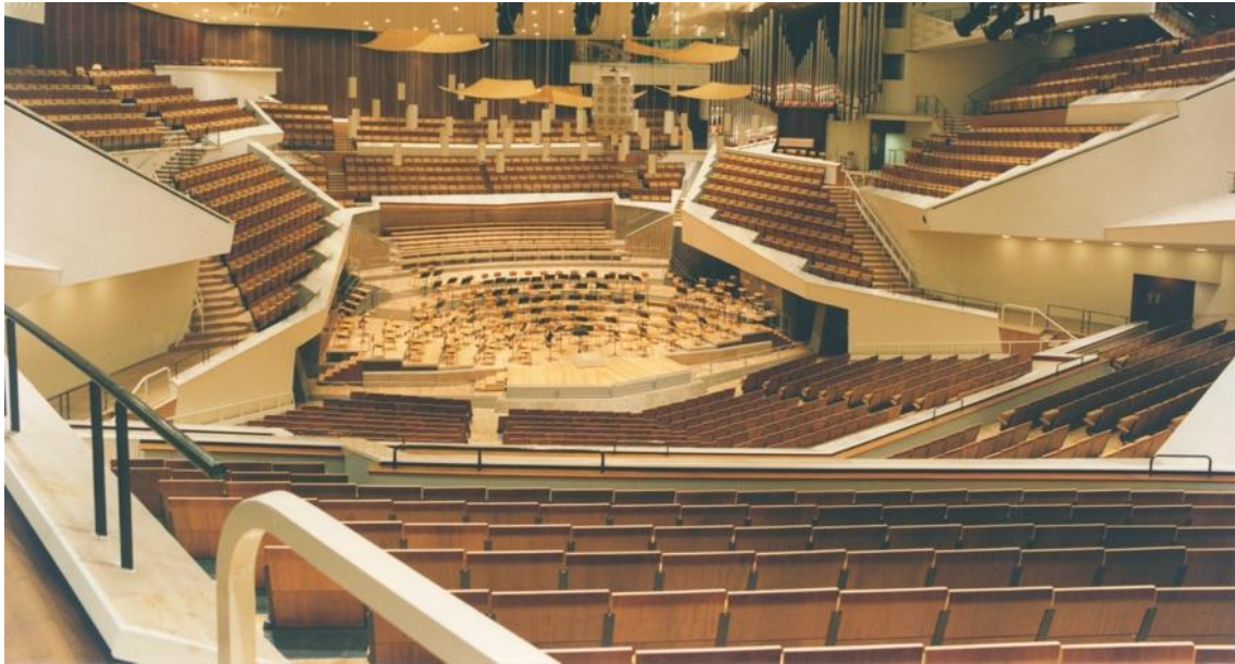
Berliner Philharmoniker, Berlin, Germany.