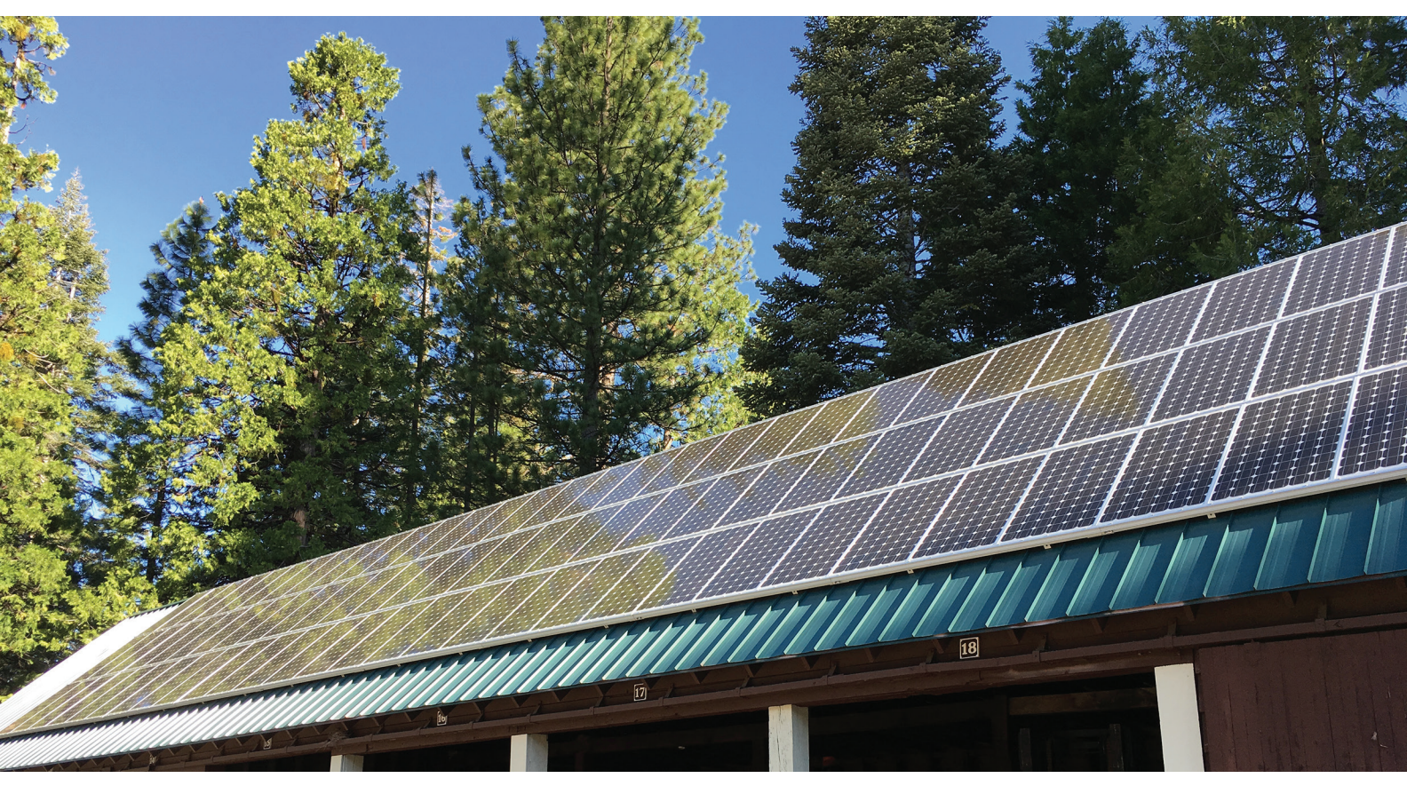
Rooftop solar panels, Lassen Volcanic National Park, California, USA. PATRICK GONZALEZ

In the US, the Residential Clean Energy Credit currently covers 30% of the cost of new renewable energy devices installed at a home (https://www.irs. gov/credits-deductions/home-energy-tax-credits). This tax credit covers solar electric panels, solar water heaters,