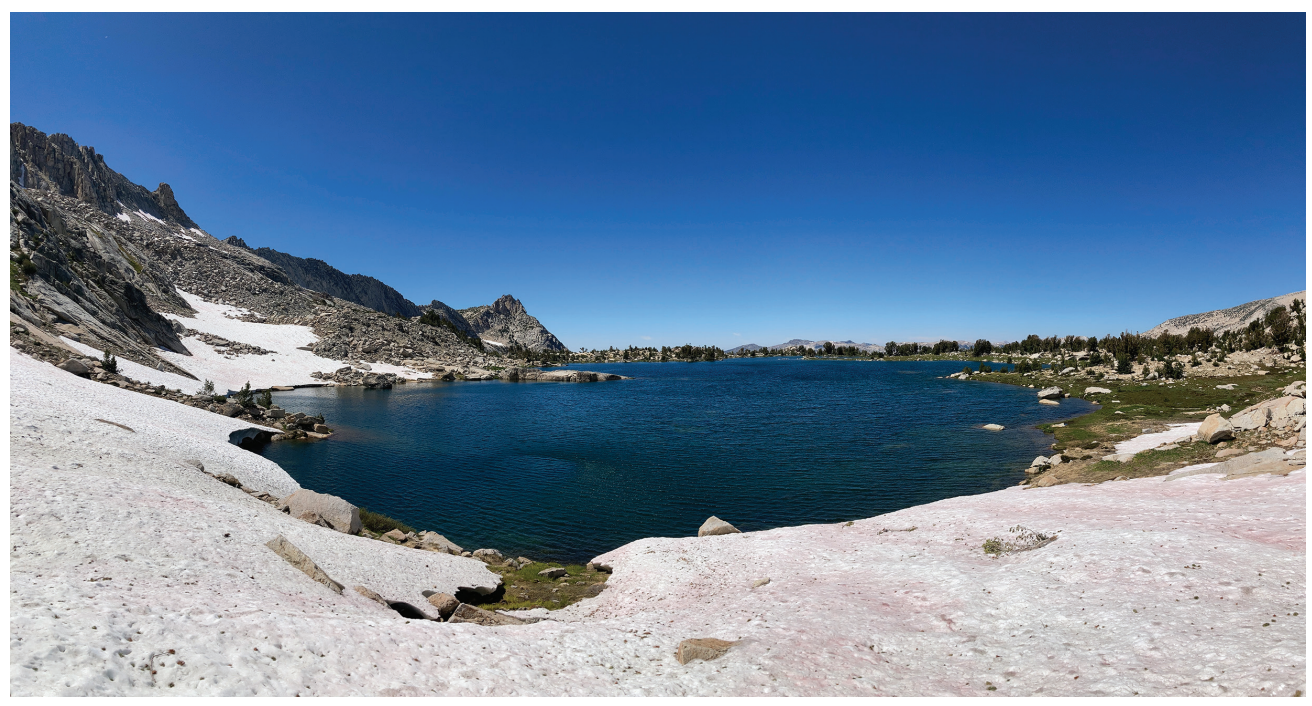
Snow at Upper Young Lake, Yosemite National Park, California, USA, August 31, 2023. PATRICK GONZALEZ

( Lynx canadensis ), emperor penguin ( Aptenodytes forsteri ), meltwater lednian stonefly ( Lednia tumana ), polar bear ( Ursus maritimus ), and western glacier stonefly ( Zapada glacier ) (US FWS 2023).