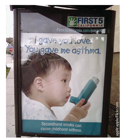
Many genes are associated with the risk of developing asthma; environmental triggers such as air pollution compound the risk.

Prior clinical trials focused primarily on subjects with milder asthma. Patients