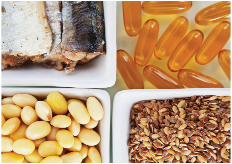
Clockwise from top left, sardines, fish oil pills, flax seeds and soybeans contain omega-3 fatty acids. The omega 3s inhibit the activity of ALOX5, an enzyme that exacerbates lung inflammation and causes asthma.

sthma is a chronic inflammatory Adisorder of the body's lungs that is associated with airway reactivity (or "twitchy" airways) and obstruction. It affects an estimated 25 million people in the United States, including 6 million