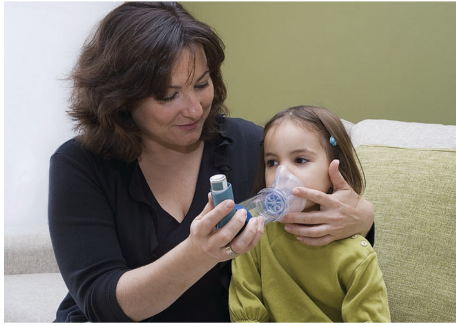
Asthma affects about 25 million people each year, including 6 million children. The prevalence of asthma is higher among black children and youths (27.2%) than among Latino (15.6%) or white (18.7%) children and youths.

Single-nucleotide polymorphism: A variation of a single nucleotide (A, T, C or G) within a DNA sequence that results in alternative forms of a gene in different individuals.