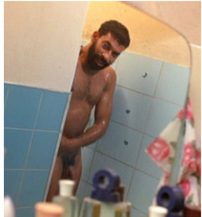
Figure 5: Still from Ming Wong, Eat Fear / Angst Essen (2008).

Fassbinder's film progressively unclothes and exposes the protagonist's body, but undermines any critique of white voyeurism and projection, first by suggesting that Ali narcissistically enjoys his own sexual exposure and, finally, by stripping for the camera, volunteering to confirm the fiction of the big black penis. In the early 1990s, Al LaValley had naively praised the unveiling of the studly Ben Salem as a sign of gay desire and empowerment (LaValley 120-21). By contrast, Wong's Eat Fear reenacts the exposure of Ali's nude body without either suggesting Ali's complicity or confirming the racist fantasy of the big black penis. Wong's choice to wear a prosthetic penis in the strip scene allows him to capture and expose the racist gaze without confirming the fiction of black hypermasculinity. The awkward and