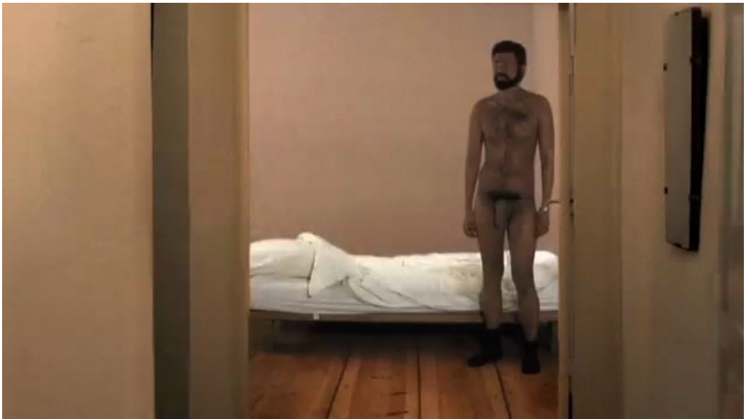
Figure 6: Ming Wong, Still from Eat Fear (2008).