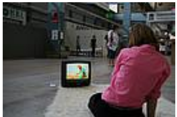
Figure 3: Ming Wong's video installation Lerne Deutsch at Kunstinvasion, Berlin, 2008.<sup>14</sup>

decommissioned flower market in Berlin-Kreuzberg.<sup>12</sup> The motto of the event, which opened for two days only and presented works by about sixty, mostly German artists was—appropriately enough— Flüchtigkeit (ephemerality).<sup>13</sup> Unlike more cinematic video art, which was displayed on large screens in the dark basement, Learn German was installed on the building's well-lit main floor, jostling for viewers' attention with numerous sculptural pieces, photographs, sound installations, and performances. Visitors could glimpse Ming Wong's video on a small, old-fashioned box television set either while strolling through the vast, open space, or, if they were intrigued enough to watch the entire ten-minute loop, crouch down on a white shag rug that appeared to be a cheap version of the one in Fassbinder's original. The rug both extended the screened space into the hall, and subtly highlighted the class difference between original and reenactment, as well as between the performer's space and that occupied by the viewer. Across this gap, the small dimensions and placement of the monitor on the floor, moreover, brought the bodies of those willing to give Wong/Petra their attention into close alignment with hers. By thus enforcing an