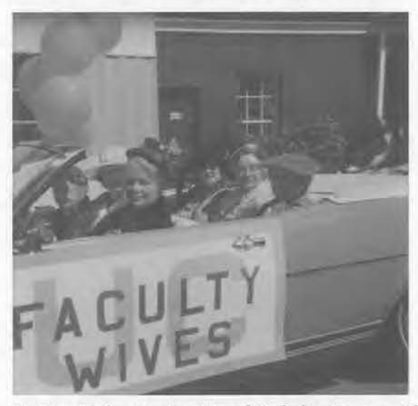
Section Club entry in City of Berkeley Centennial Parade, 1978.

Since 1869, the contributions of the faculty wives to the Berkeley campus have evolved in many different directions, but three constants can be identified.<sup>3</sup> First, with