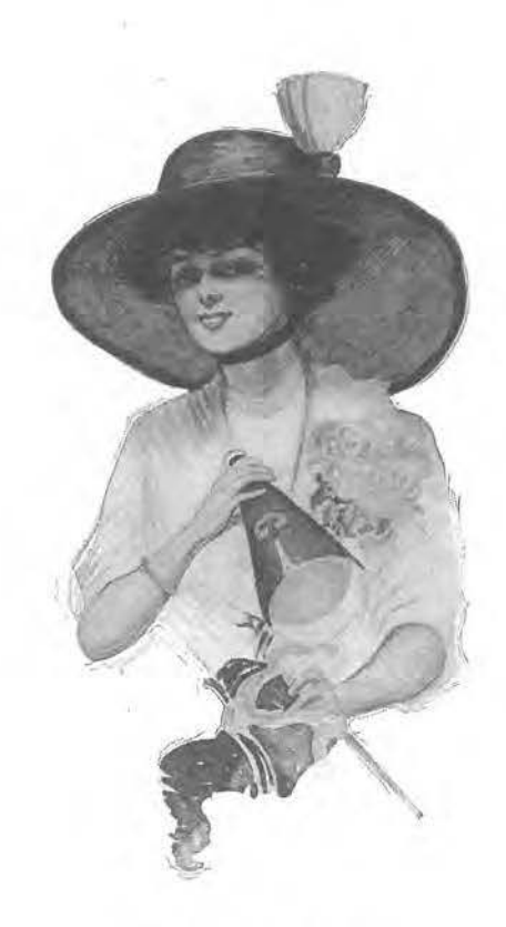
1913 Blue and Gold.