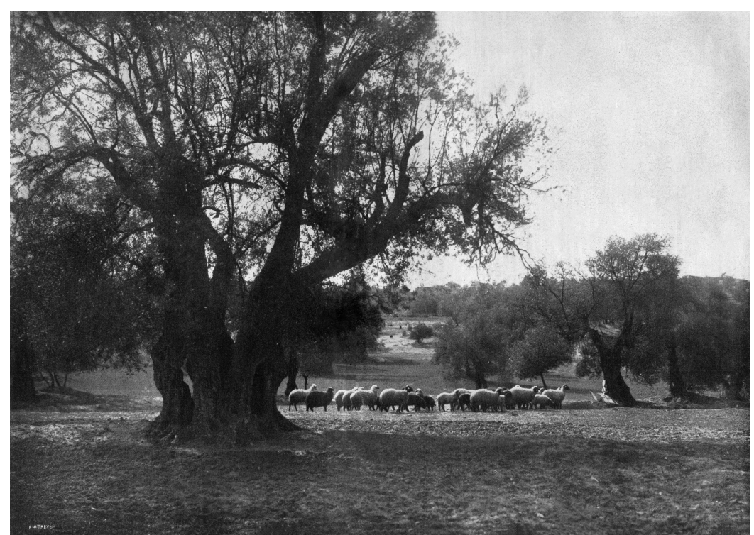
Figure 3. Stock Photo - Goats grazing and olive trees, between Garian and Jefren, Libya, photograph by Luca Comerio, from L'Illustrazione Italiana , Year XL, No 16, April 20, 1913.