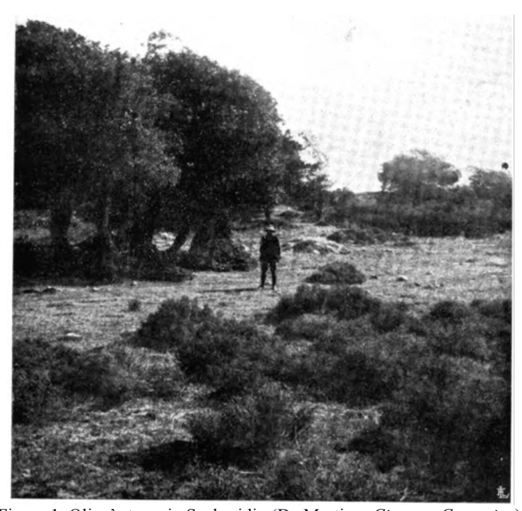
Figure 1. Olive's trees in Sceksaidi. (De Martino, Cirene e Cartagine).

In addition to descriptions of agrarian sites, photographic sections were typically included in travel books across Libya to give the reader a visual experience of this new Mediterranean territory before or after Italy's invasion (see Figures 1 and 2). Giacomo de Martino published images of olive tree orchards while lamenting their current state of desolation. Their presence was treated just like archeological remains of ancient Greek and Roman civilizations endangered by the land mismanagement of the locals. Working for the periodical L'Illustrazione italiana , the photographer Luca Comerio provided a snapshot of the ideal location that Tripolitania represented for an Italian peasant by showing a scene of goats grazing in a field of olive trees.