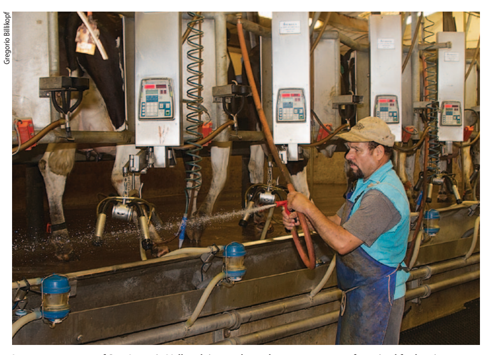
In a recent survey of San Joaquin Valley dairy workers, the reasons most often cited for leaving employment were compensation and benefits, economic problems at the dairy, and personal and family matters.

Eighty-eight percent (n = 183) of the subjects were Hispanic and 12% (n =26) were white (of the latter, 81% were Portuguese). The average worker was 36 years old; the range was from 19 to 69.