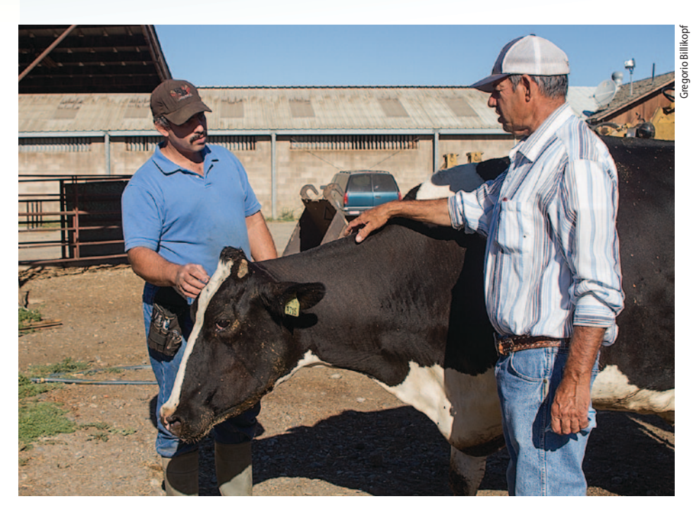
Dairy production cannot be readily downsized in response to labor shortages, making employee turnover an ongoing management concern.

Dairies are labor intensive because cows are milked two or three times per day year-round. Excessive employee turnover is expensive and upsets routines, which in turn can affect animal health and dairy productivity. By all accounts, 2009 was the worst year since the Great Depression (Willis 2009) for U.S. industries, including dairies (Barrett 2012). As a recession intensifies, the number of employees who voluntarily quit generally goes down while the number of terminations increases. Using Bureau of Labor Statistics data, Hill (2011) showed exactly that pattern between 2007 and 2010, with 2009 as the peak year for terminations and the lowest year for voluntary quits.