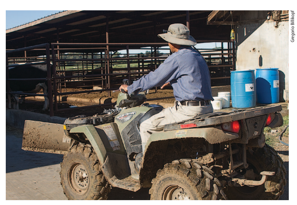
The average length of dairy employment was 6.6 years; the range was from 2 weeks to 40 years. The average number of jobs among people with previous dairy positions was three.

Using the snapshot approach, the average length of employment at the time of interview was 6.6 years, and the range was from 2 weeks to 40 years. By contrast, when we used the completed-tenure approach, the average length of employment was only 3.5 years. The subset of subjects without previous dairy employment (n =92), who would not have been interviewed if we had used only the completed-tenure approach, had an average length of employment of 7.1 years, and the range was from 5 weeks to 40 years. The subset of subjects with previous dairy jobs (n = 114) had an average length of employment of 6.2 years. On average, these subjects had held three dairy positions, that is, the present job plus two more. As Billikopf noted in 1984, there is great variability