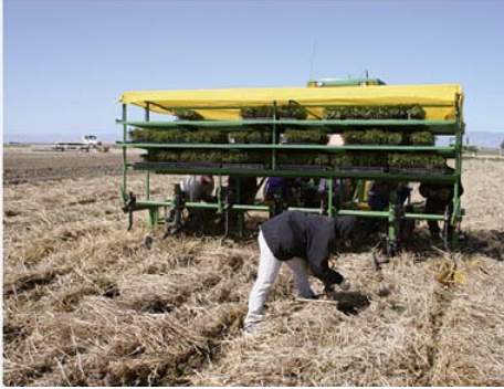
Cover crops in conjunction with conservation tillage helped to maintain soil fertility. Left, cotton and tomato crop residues prior to no-till transplanting; center and right, no-till cotton planting with a John Deere 1730 no-till transplanter directly into a cover crop of triticale-winter rye-vetch.

nitrogen were more variable. The CTCC and STNO treatments had much higher total soil nitrogen values than expected; STCC had a slightly larger value, while CTNO had a much larger loss than expected. Nitrogen is generally much harder to budget than carbon. The differences between the budgeted and actual values for the two cover-crop treatments suggest that the actual nitrogen fixation rate of the cover crop was larger than we estimated. The largest difference between expected and actual total soil nitrogen was in the STNO treatment, where we expected a total nitrogen loss and instead we saw an increase of 535 pounds nitrogen per acre. This difference is difficult to explain. The nitrogen budget does not account for nitrogen losses due to leaching or denitrification; these two processes may account