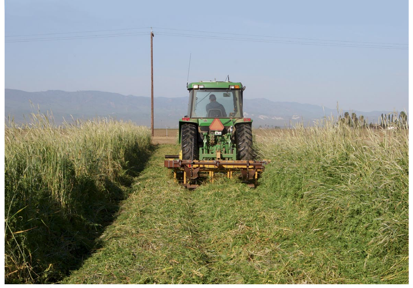
One challenge of growing cover crops with conservation tillage is managing the residue to avoid complications with furrow irrigation.

systems have the potential to accumulate organic matter in some geographic regions. In other regions, conservation tillage redistributes organic matter to the soil surface while decreasing organic matter in the subsurface, depending on soil type and climate.