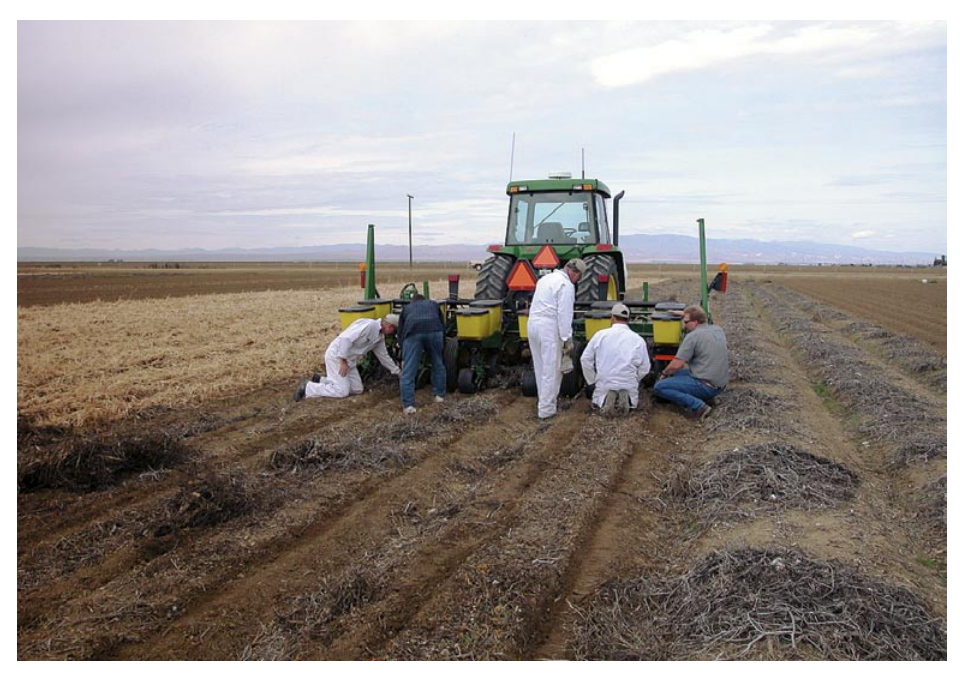
In this study, some soil parameters improved with conservation tillage, while others declined. For example, after 4 years of conservation tillage without a cover crop, soil salinity increased significantly. Above, researchers evaluate no-till planting into tomato residues.

In other parts of the United States, conservation tillage and cover cropping have been shown to improve soil quality. In our study, after 4 years of conservation tillage the soil's physical properties improved, but its fertility degraded somewhat. Bulk density and penetration resistance were lower in the conservation tillage systems; these soil properties improve water infiltration and conservation, and improve rooting depth. Conservation tillage increased available phosphorus but redistributed potassium from the subsurface to the surface by accumulating organic matter at the soil surface and not remixing it with tillage. Nitrate accumulated at the surface as well. By concentrating these