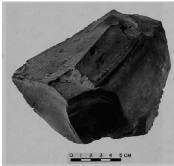
Fig. 2. Obsidian piece from Jose Basin (USFS #53-1984-39).

Two additional large pieces of obsidian were discovered during test excavations at FRE-291, located on the north shore of Huntington Lake at Bear Cove. The two pieces were found in situ , placed one atop the other, between 20 and 46 cm. below present ground surface. Bedrock was encountered in the excavation unit at 50 cm. below surface. The artifacts presumably were cached. Although no pit outline was