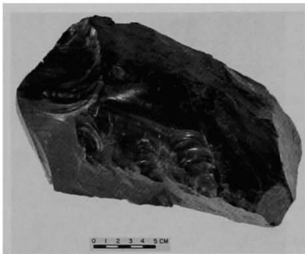
Fig. 3. Obsidian core weighing 7 kg. from FRE-1984.

visible, they obviously had been emplaced into a culturally sterile stratum of glacial cobbles and pebbles.