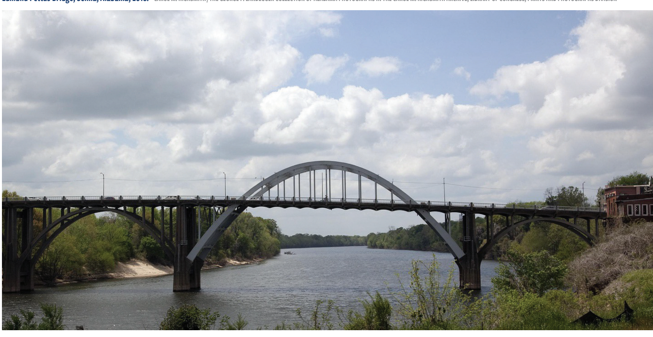
Edmund Pettus Bridge, Selma, Alabama, 2010.

At times history and fate meet at a single time in a single place to shape a turning point in men's unending search for freedom. So it was at Lexington and Concord. So it was a century ago at