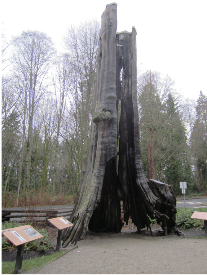
The millennium-old Hollow Tree in Stanley Park, Vancouver, has been stabilized and interpreted as an historic relic. Photographed in 2012.

districts (or areas). This is analogous to protecting forests as well as trees. Adjacent to the Empress and Victoria's Inner Harbour is "Old Town." Dozens of vernacular buildings dominate three areas: the old commercial core, a cluster of waterfront warehouses, and Chinatown. Old Town traces its origins to Victoria's role as the point of departure for prospectors heading to the Fraser River Gold Rush of 1858. Old Town has been designated a municipal historic area and its development commemorated as a National Historic Event. 55