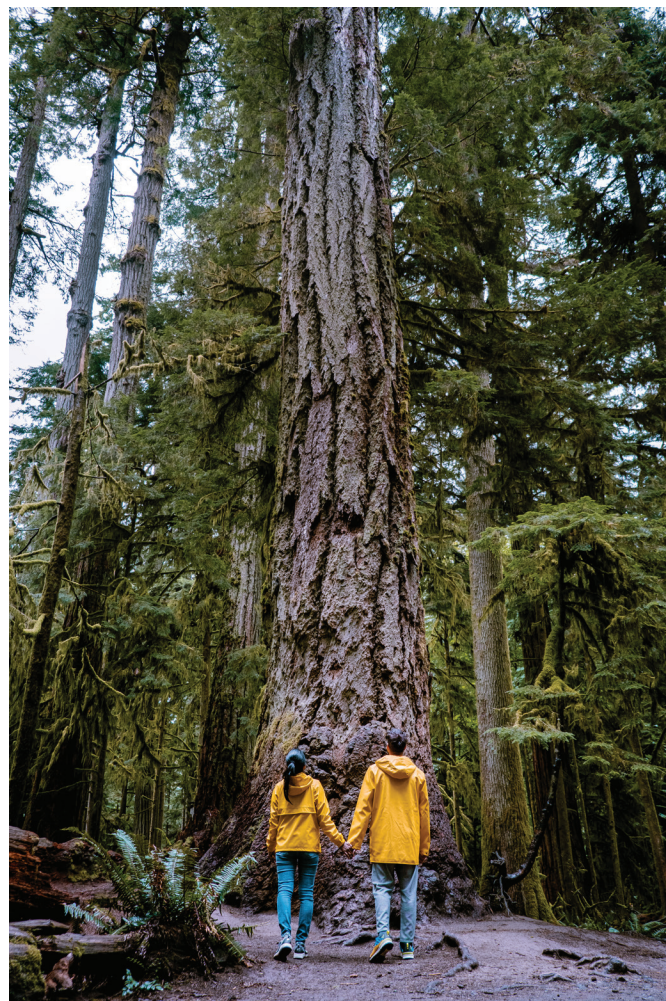
Cathedral Grove, Vancouver Island. PHIL CARSON

Advocacy groups argued for more effective protection and stricter enforcement. Protests erupted in August