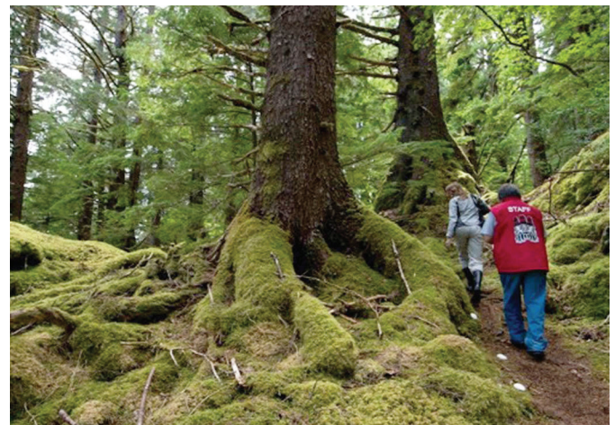
Gwaii Haanas Watchman Walter Russ leads a tour in Haida Heritage Site, British Columbia, 2012.

Created as a tool for the conservation of human-made resources: buildings, structures, cultural landscapes,