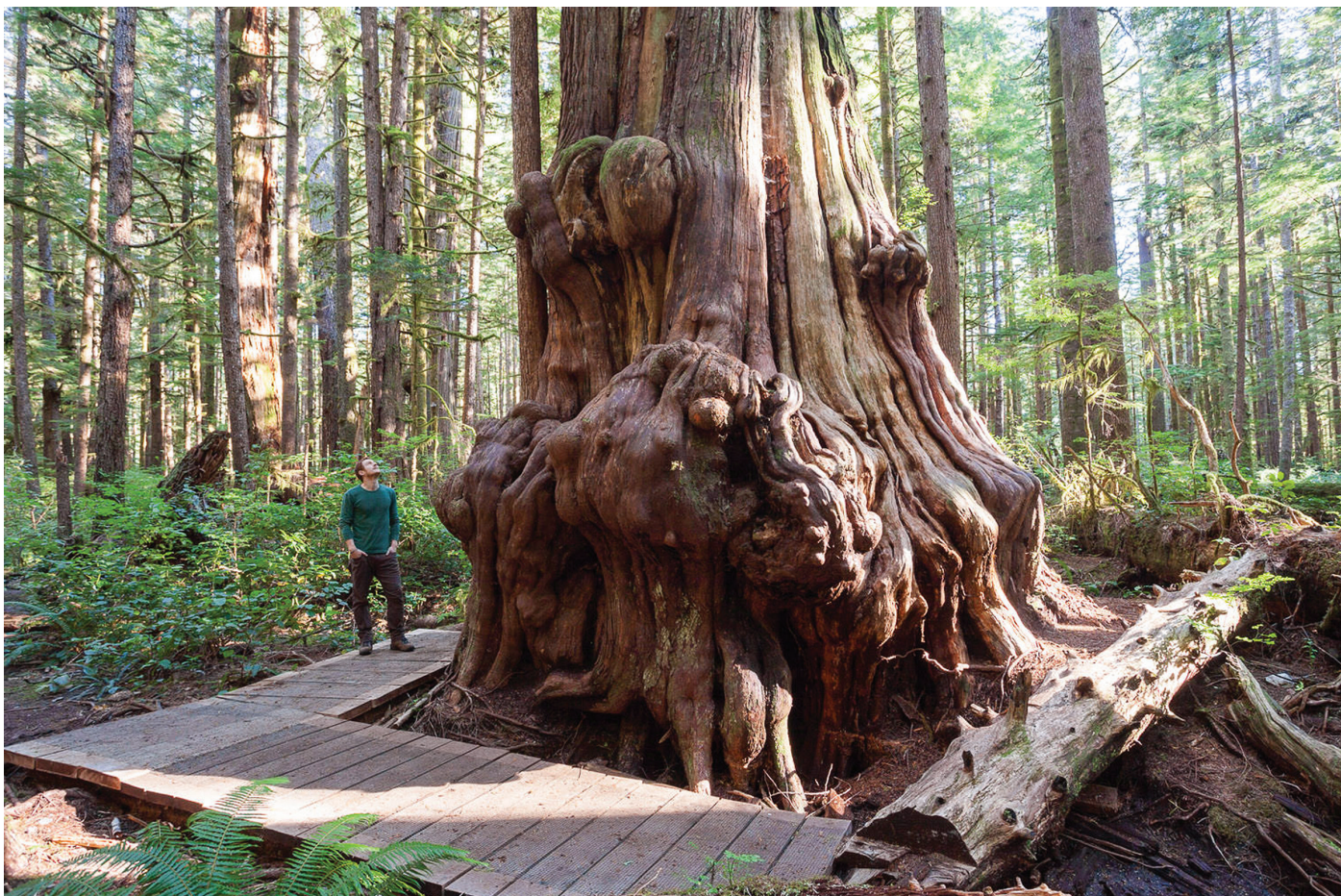
“Canada’s gnarliest tree,” in Avatar Grove, has been made more accessible to visitors with the construction of a cedar plank walkway by the Pacheedaht First Nation.