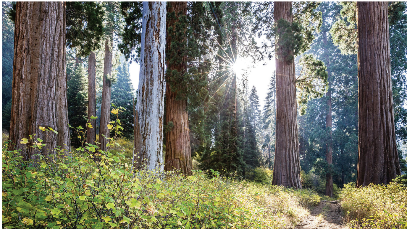
Alder Creek Grove, in California’s Sierra Nevada, contains nearly 500 giant sequoias.

Ever since antiquity, extraordinary places, both built and natural, have been selected for protection. Most were the former: buildings considered to have exceptional value. The first recorded example of protective legislation may be a 5th-century CE decree by the Roman Emperor, Majorian, who fined magistrates who presumed to grant permission for the removal of fragments of historic monuments, going so far as to threaten violators with amputation of their hands. 35