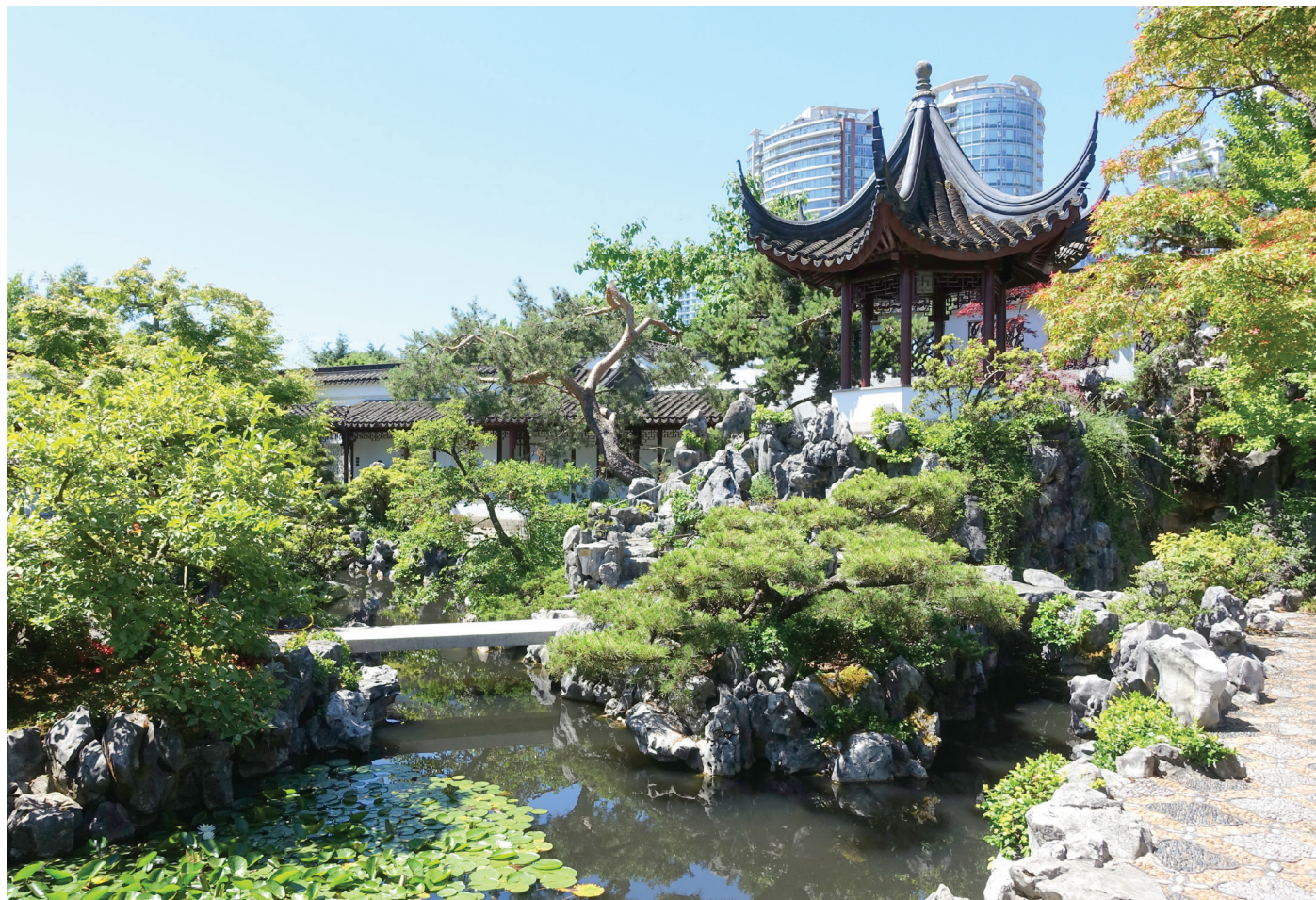
The Dr. Sun Yat-Sen Classical Chinese Garden and Park, in Vancouver, BC, is protected by designation.

Consistent with today’s more democratic ideologies, protection now often extends not only to exceptional places, such as the Empress Hotel and the Hollow Tree, but also to unremarkable, vernacular buildings, landscapes, and ensembles, called historic (or heritage)