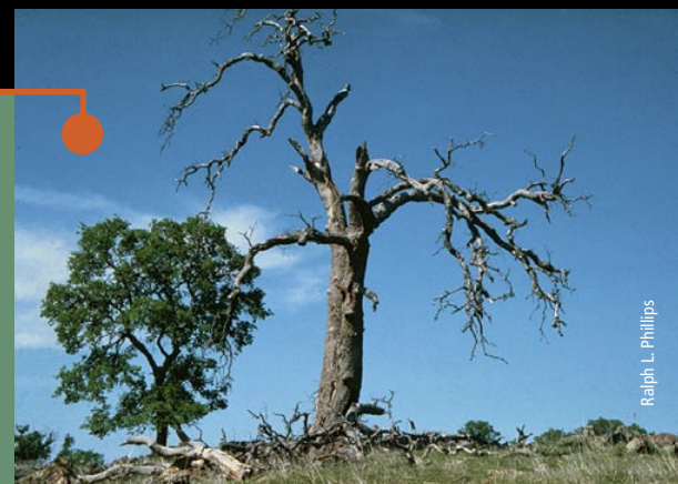
Ralph L. Phillips

Blue oak trees are a valuable economic and aesthetic resource in California oak woodlands, which provide some of the richest wildlife habitat in the state. However, their current regeneration rates may not be adequate to replace mortality, due to a variety of factors. In some regions, the regeneration of blue oak is limited by the ability of seedlings to survive long enough to become larger saplings. Two related, long-term studies by UC researchers examine the growth of blue oak seedlings and the effect of exclosures — which protect seedlings from livestock and wild-animal grazing — on their survival.