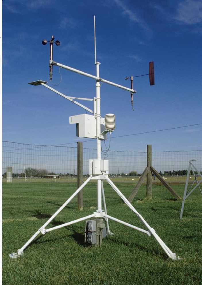
It is well known that climate is an important factor influencing crop yields from year to year. Weather-based yield forecasts can be developed at lower cost than field surveys, and with longer lead times. Above, a weather monitoring station.

our models offer significant timing advantages over existing forecasts for almonds (3 to 4 months earlier than current forecasts), hay (2 months earlier), strawberries (5 months earlier) and walnuts (7 months earlier).