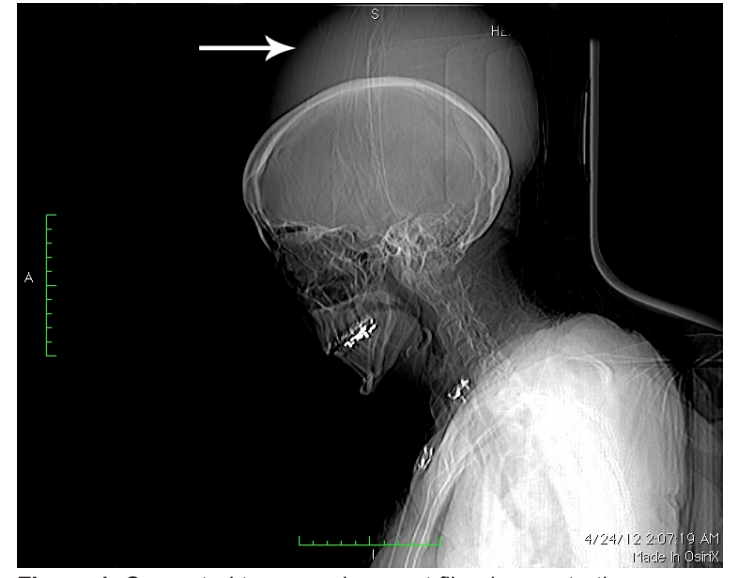
Figure 1. Computed tomography scout film demonstrating cephalohematoma.

with the on-call neurosurgeon and subsequent transfer to a nearby trauma center was initiated. Prior to transfer, the patient's blood pressure had deteriorated to 90/60 mmHg with a pulse of 128 beats-per-minute, and the hematoma had progressed below the level of the chin into the cervical soft tissues. The patient was transferred 2 hours and 20 minutes after arrival.