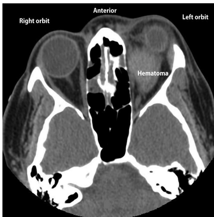
Figure 2. Computed tomography demonstrating left retrobulbar hemorrhage with proptosis

Incomplete ultrasound evaluation of the retro-ocular structures is possible considering the eccentric location of