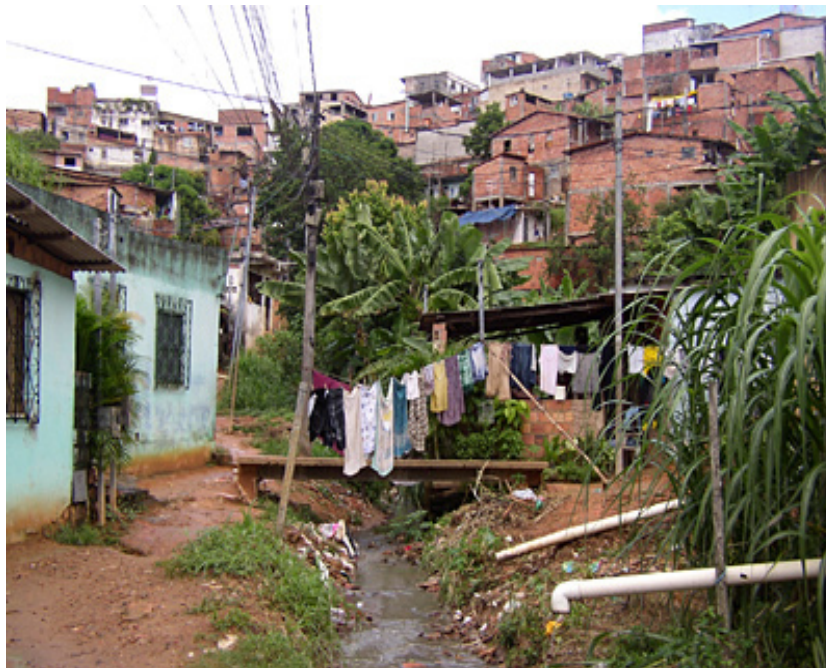
A typical slum in Brazil. Of the populations that develop TB and HIV/AIDS, roughly 80% originate from the slums.

Riley: Well prevention, but also trying to understand the kind of biology behind it. Of course, it's the economics and social construct, but I think there's a scientific way to answer and address these questions. There's a very simple example, as I've mentioned earlier, people get affected because they're exposed to contaminated water, so what do you do? Well, just put a sewage system; cover up these open sewers—that's it. A very simple intervention, but nobody would know that until somebody went in there and did a detailed risk factor study. We actually did a case control study and found that people who lived in houses closest to the sewage were much more likely to have severe disease than those who weren't even if they were living in the same community. There are lots of other slums in the city where there are no leptospirosis cases because they don't have this type of valley condition. If you go to other places that do have it [the valley situation], they have a similar set of problems. They have places where people are exposed to sewage in high density. But nobody [in terms of researchers and/or other external organizations] goes to these slums, it's dangerous. So we don't get the