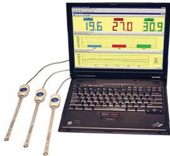
Figure 2. The FlexiForce B201 pressure sensor and Economical Load and Force (ELF) software.

We determined the pressure applied to the representative digit by each of the various tourniquet methods to evaluate for safety. We measured the pressure of the various tourniquet methods using the FlexiForce B201 pressure sensor, a flexible, wafer thin (0.005") 10mm diameter disk-shaped sensor designed specifically to measure the force between two surfaces without disturbing the dynamics of the test (Figure 2). The sensor was placed in a standardized location on the dorsum of each digit equidistant from the metacarpophalangeal joint and proximal phalangeal joint. We calibrated the pressure sensor to measure pressures in the range of 0 to 1000 millimeters of mercury gathered