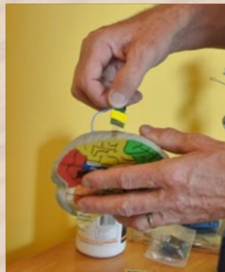
Prof. Rabaey demonstrates implantation of microsensor within the brain.

Prof. Rabaey: If I want to put this in a human, for whatever purpose, it could be used to address motor dysfunction or any other type of neural disease. Once you do an implant you want to make sure it stays there for a long time. People typically talk about ten years minimum for these devices. It's hard. No one has really done it in the neural space because there are a whole bunch of problems that emerge over time. However, not everything has to be chronic. There are certain implants that could be used for short term implant and explant. A very good example is neural implants for stroke patients. If somebody has stroke, the stroke basically destroys certain regions of the brain. It turns out that many stroke patients afterwards are capable of remapping some functionality, so if they have motor issues, they can remap some of those motor functions to other regions in the neighborhood that are not damaged. Same thing works with speech. Stroke patients initially have a hard time speaking, but then they can recover