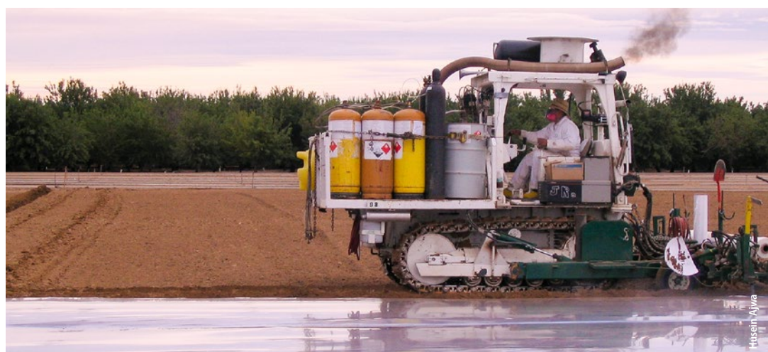
Tarping fields helps to retain fumigants in soil.

Incomplete mortality of V. dahliae (60% to 80%) was observed with all tested