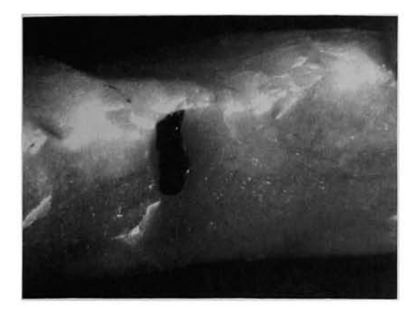
Fig. 3. Micrograph (10X) of Clovis point replica, lateral margin prior to margin dulling.