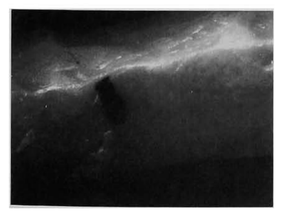
Fig. 5. Micrograph (10X) of Clovis point replica, margin dulled by rubbing against quartzite flake for 60 seconds, then adding moisture and rubbing for an additional one minute.

ever, obsidian margins could be polished using ocher or an appropriate microcrystalline material.