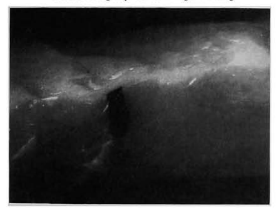
Fig. 4. Micrograph (10X) of Clovis point replica, margin dulled by rubbing against quartzite flake for 60 seconds.