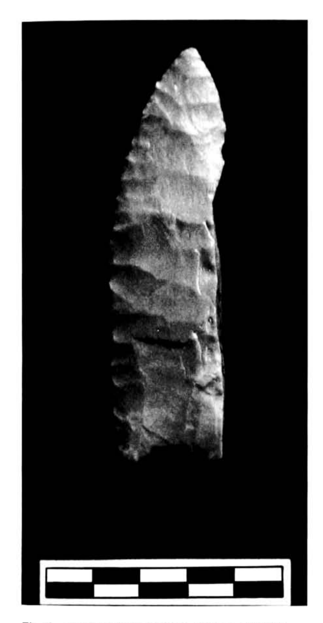
Fig. 6. Clovis point from Naco, Arizona, showing longitudinal fracture which initiated within the basal concavity, burinating the lateral margin (cm. scale).

in southern Idaho appear to have been polished, unlike Clovis materials from the Escapule, Lehner, Leikum, Murray Springs, and Naco sites, curated at the Arizona State Museum, which show a fine abrasion without subsequent polishing. This might support an earlier hypothesis presented by Bonnichsen (1977) who