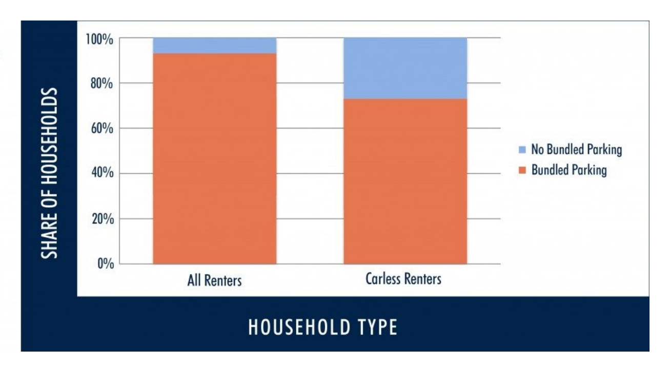
FIGURE 1 Bundled Parking and U.S. Renter Households

Most American households have at least one automobile; census data show that nationwide only about 7 percent of rental households do not have a car. As with bundled parking, there is considerable variation in the share of households without a vehicle across metros, from 26 percent in metropolitan New York City to 1.5 percent in the St. George, Utah, metropolitan area. Across the entire 2011 AHS sample — which includes renter and owner-occupied units — more than 71 percent of carless households live in a housing unit with a bundled parking space, as opposed to more than 96 percent of households with a vehicle. Within our sample of renter-occupied units, these percentages are 73 percent and 93 percent, respectively. Quantifying the relationship between vehicle ownership and parking is important because carless households are paying for something that they most likely do not need or want.