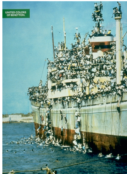
Figure 2. Concept by Oliviero Toscani, Boat . 1992. United Colors of Benetton.

opinion on burning social issues – such as migration, AIDS, the Gulf and the Balkan War, the death penalty, and the Mafia – while positively associating responsible attention and sensitivity toward these issues with the United Colors of Benetton brand. One of the campaigns, launched in the spring of 1992, shows a photograph of an anonymous mass of Albanian migrants, fleeing their country in 1991 on a boat while leaving the port of Durrës. The boat is overloaded with migrants, as even more struggle to get on board, either by swimming or by climbing ropes that tie the boat to the dock. The image is one of a massive invasion, in which an exhausted, faceless crowd threatens Italians’ safety [Figure 2].