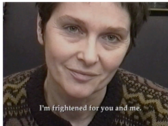
Figure 4. Anri Sala, Intervista . 1998. Audience Idéale and Icarus Films.

Sala’s incorporation of TV news within his mother’s private recollections can be compared to Paci’s transformation of the same historical events of March 1997 into a fairytale. Both provide a keen and subtle critique of the dominant media’s narrative mode of producing the reality effect. While Paci replaces the stereotypical images from TV news and newspapers with a delicate depiction of his three-year old daughter, Sala incorporates the reality effect of the TV news and frames it within a different affective context, by repositioning the spectator in relation to those stereotypical images. Sala reverses an already established media relationship between text and context, subject and framework: if Italian TV news presents an anonymous and untameable Albanian mass as the framework within which each Albanian migrant’s story is to be understood, Sala plants the Albanian insurgent and migrating mass of March 1997 within Valdet’s private story. In Sala’s work the viewpoint is no longer the mass group composition of Toscani’s photograph nor Amelio’s aerial shots of Partizani . Instead it is Valdet’s, whose maternal relationship to the filmmaker is thus transferred onto the spectator. The spectator, in turn, is invited to align him/herself with her world views and her voice.