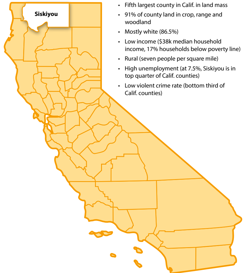
FIG. 1. Siskiyou County is a large, rural California county. Its residents are mostly white. Compared to other California counties, it has relatively high unemployment, a low violent crime rate and low median household income.

These strict county measures, which discarded and replaced publicly developed regulations, stoked reaction. When the Siskiyou County Board of Supervisors met in December 2015 to vote on these measures, advocates and cultivators presented 1,500 signatures to