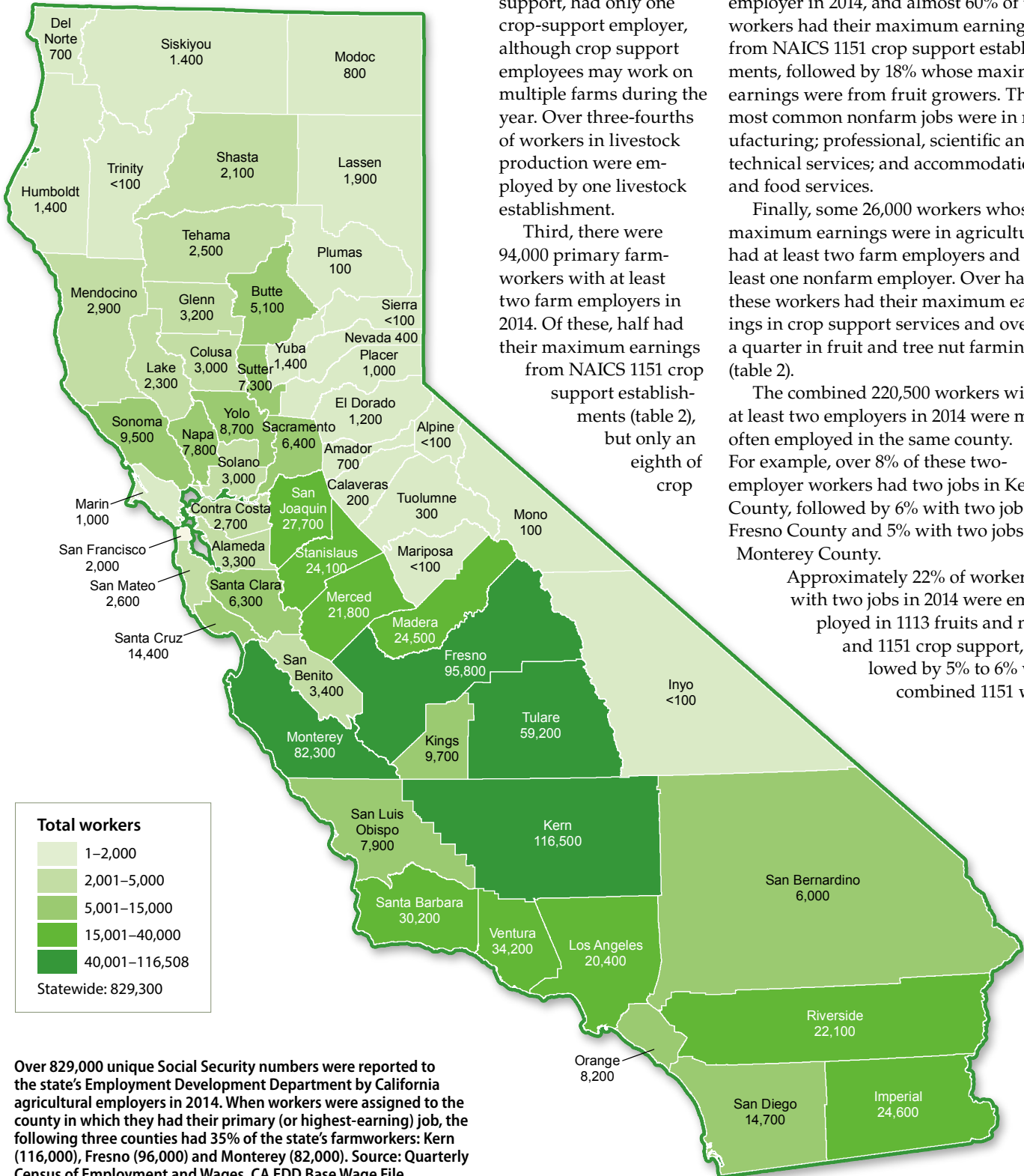
Over 829,000 unique Social Security numbers were reported to the state's Employment Development Department by California agricultural employers in 2014. When workers were assigned to the county in which they had their primary (or highest-earning) job, the following three counties had 35% of the state's farmworkers: Kern (116,000), Fresno (96,000) and Monterey (82,000).

Approximately 22% of workers with two jobs in 2014 were employed in 1113 fruits and nuts and 1151 crop support, followed by 5% to 6% who combined 1151 with