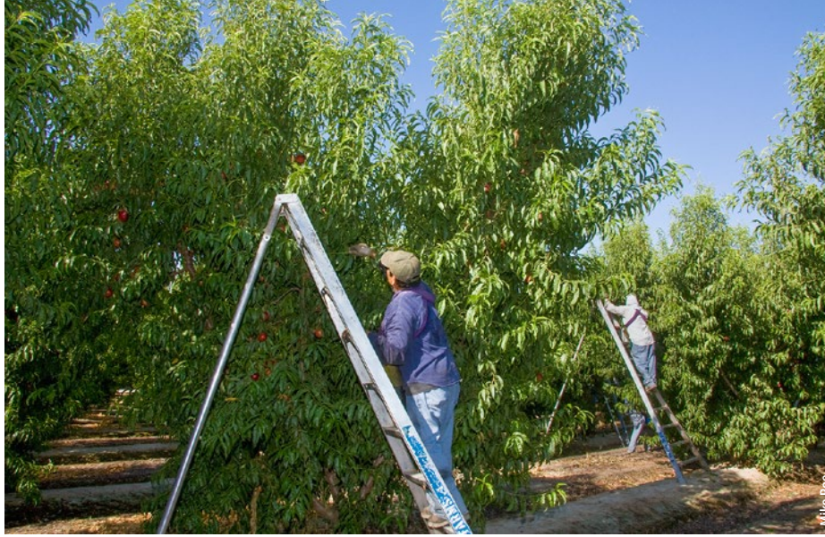
In 2014, the average earnings for workers in the fruit and tree nut farming sector were $17,600.

5613 employment services, 1113 fruits and nuts with another 1113 job, at least two 1151 crop support jobs, and 1112 vegetables with 1151 crop support.