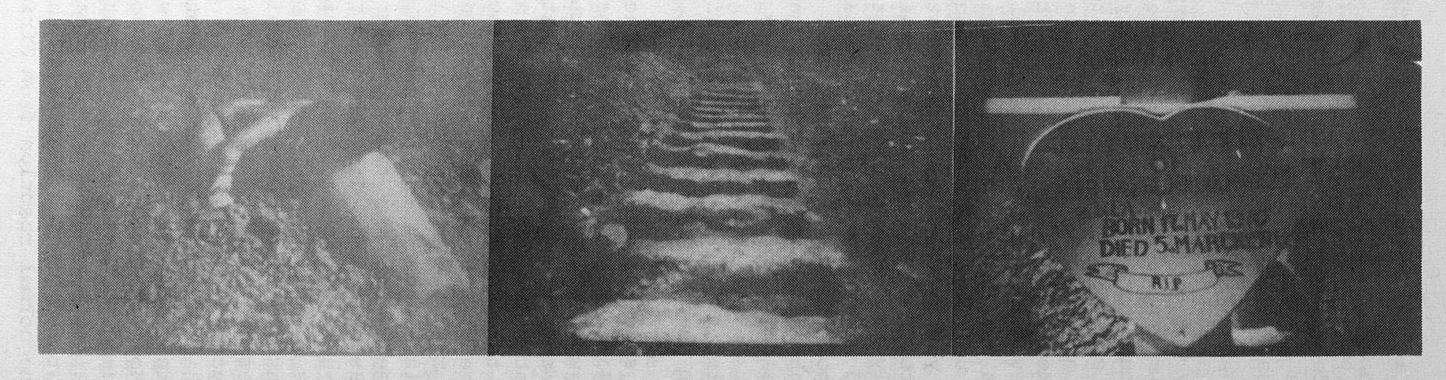
"The graves have been dug in preparation for the next month's toll"