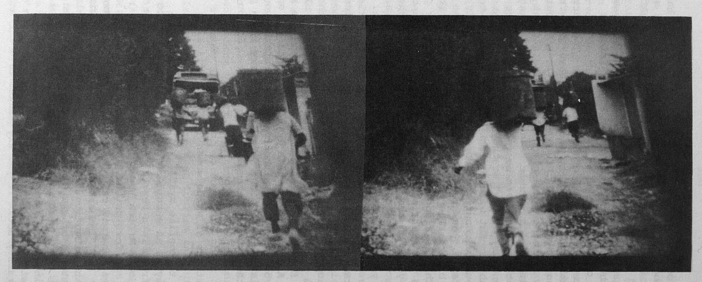
"These blacks collect garbage in the back alleys of the white suburbs - They start chasing the truck at 6 every morning. The white driver never stops."