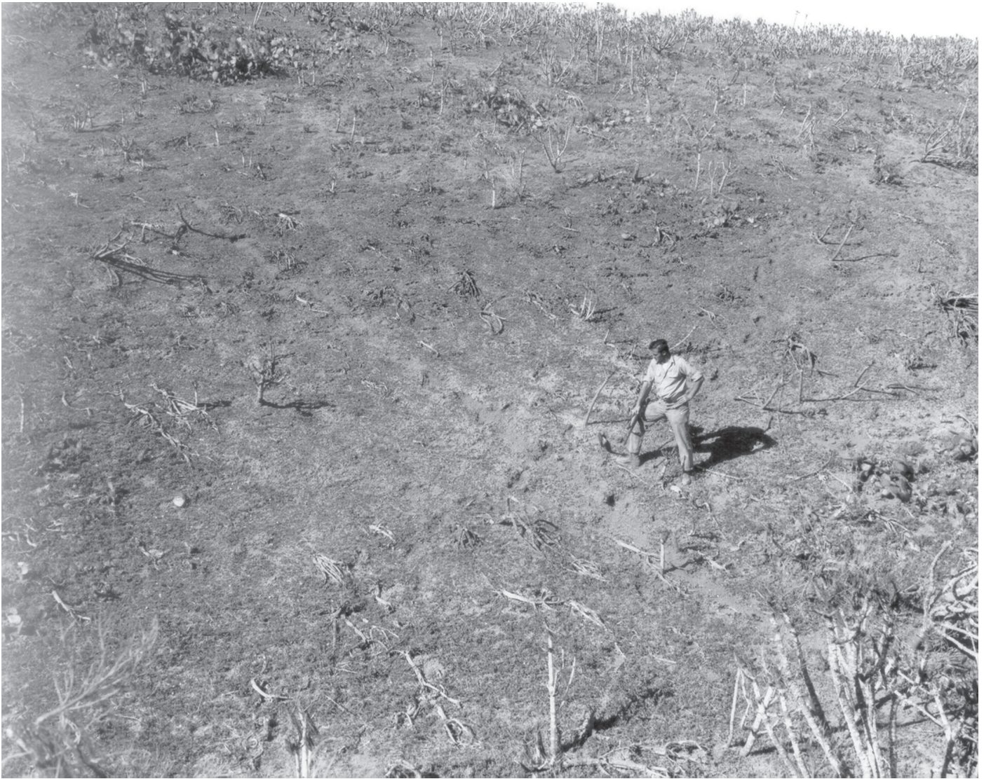
FIGURE 2. Figure 2. Extensive damage from rabbits on Santa Barbara Island left it in the worst condition of the five islands. Photographer and date unknown. CHANNEL ISLANDS NATIONAL PARK ARCHIVES, ACCESSION NO. 217, CATALOGUE NO. 3157

Prior to that time, agency officials consulted with scientists and wildlife specialists before expeditiously eliminating non-native mammals by shooting them. Superintendent Ehorn decided to follow this course. In 1977, working with a ranger and a veterinary scientist, he shot all the burros they could find. This time he had ordered a NEPA document to be completed but did not inform the Navy. Nevertheless, the Navy found out midway through the operation and asked Ehorn to wait for completion of procedural paperwork. Instead, the NPS team continued shooting for the rest of the day. Ehorn hoped the issue was over, but a woman trespassing without the requisite ranger guidance saw the carcasses and emotionally informed the editor of the Santa Barbara News-Press . In addition, a pilot flying over the island reported one burro still standing. Ehorn rushed out to San Miguel Island to dispatch the remaining burro but faced severe criticism from the local news editor. Hoping to placate him, Ehorn organized a trip to the