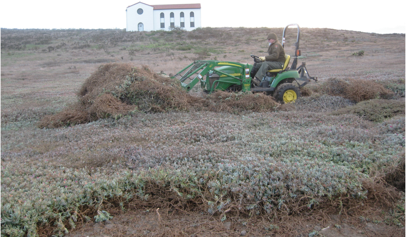
FIGURE 4 (top). Lobo Canyon on Santa Rosa Island in 2018 showing vegetation regrowth after the stream was declared “non-functional” in 1995 and the cattle were removed two years later. LARY M. DILSAVER