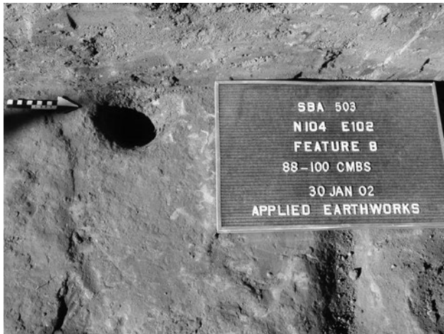
Figure 3. Mortar in the bedrock floor of Swordfish Cave.

below surface. The stratum that covered bedrock and the feature, IIa, was intact, and was marked throughout the cave by high concentrations of cultural materials that reflected a residential occupation.