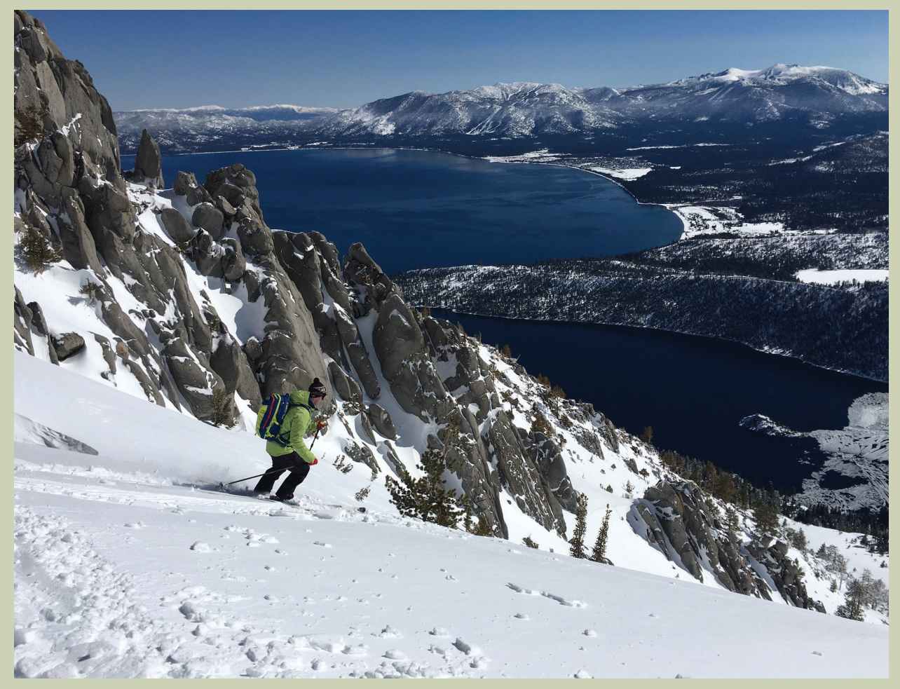
Enjoying the unique geodiversity of Lake Tahoe, California, USA.

Box 2. Climate Change Adaptation Action Plan development: Lake Tahoe Basin, California/Nevada, USA