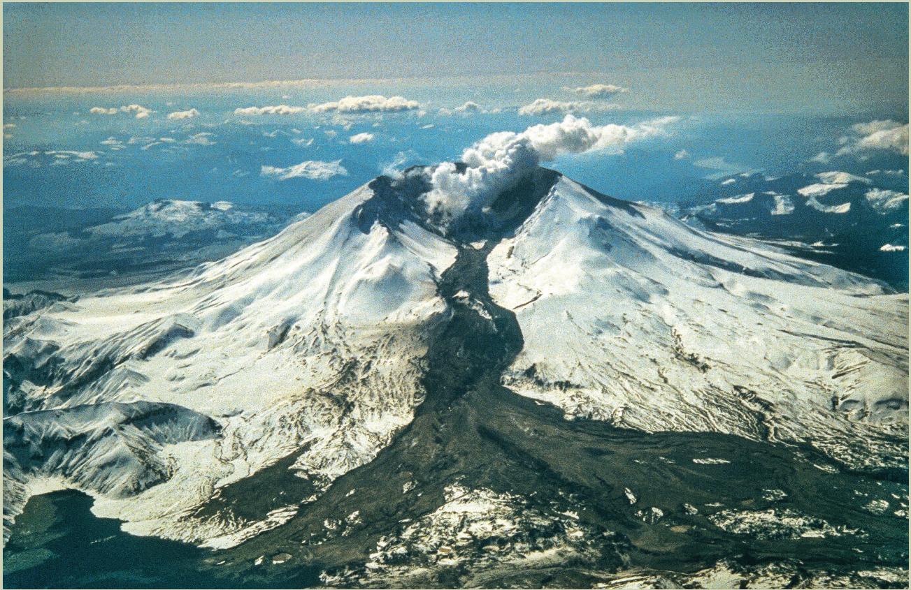
Mount St. Helens in 1982, showing the active volcano, a new lahar, and Spirit Lake (lower left).

multi-criteria decision-making approach was specified (NASEM 2018). In 2019, USFS commissioned the William D. Ruckelshaus Center of the University of Washington and Washington State University to develop a report titled Situation Assessment for the Long-Term Management of the Spirit Lake/Toutle–Cowlitz River System (Ruckelshaus Center 2019). The purpose was to engage a broad spectrum of stakeholders in order to identify and clarify key issues to be considered within a multi-criteria decision-making framework.