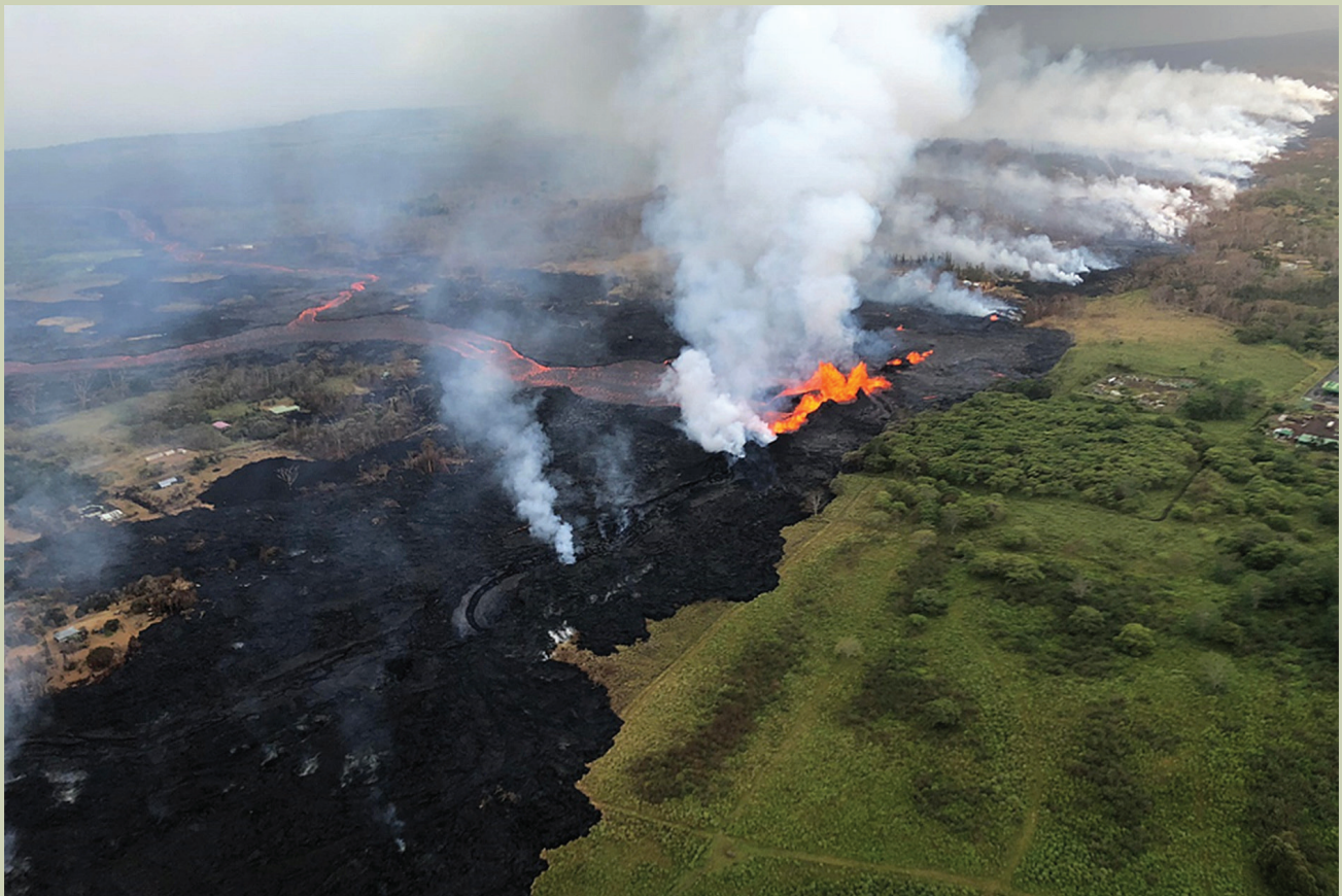
Aerial view of lava flow invading housing subdivisions in the Lower East Rift Zone, Kilauea volcano, Hawai'i, May 2018. US GEOLOGICAL SURVEY

Hawai'i Volcanoes National Park (HAVO) is located on the island of Hawai'i, the largest island of the Hawaiian archipelago. The park comprises more than 21 square miles and includes two historically active volcanoes, Kilauea and Mauna Loa, within its boundaries. The area was designated a national park in 1916. Owing to its unique geological features and biodiversity, the park was further designated as a UNESCO biosphere reserve in 1980, and was inscribed on the World Heritage List in 1987 under criterion viii for its unique geological features.