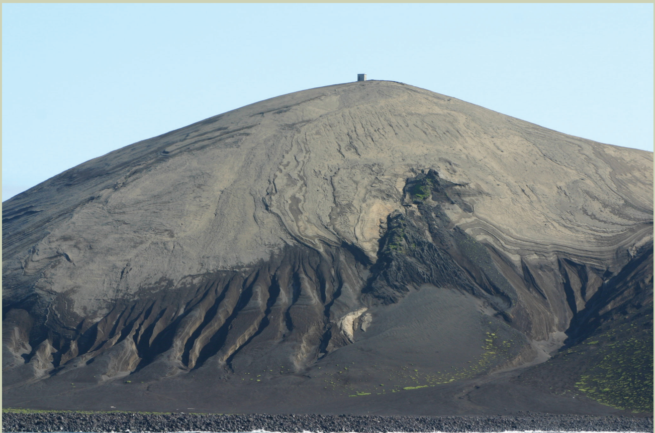
Surtsey World Heritage Site, Iceland: A new island dedicated to long-term research of ecosystem dynamics, and closed to visitation.

The eruption of Mount St. Helens on May 18, 1980, was unusually well monitored and observed and subsequently studied by scientists from around the world. Our current understanding of several important eruptive processes such as volcano sector collapse, the dynamics of pyroclastic surge and flows, the mechanics of debris flows and mudflows, and degassing of continental stratovolcanoes all originated with observation and studies of the 1980 eruption. With 57 fatalities, the 1980 eruption was the deadliest and most economically destructive volcanic event in the history of the United States. In 1982, the landscape around the volcano was protected as Mount St. Helens National Volcanic Monument to preserve the volcano and allow for the eruption's aftermath to be scientifically studied: a new gift to