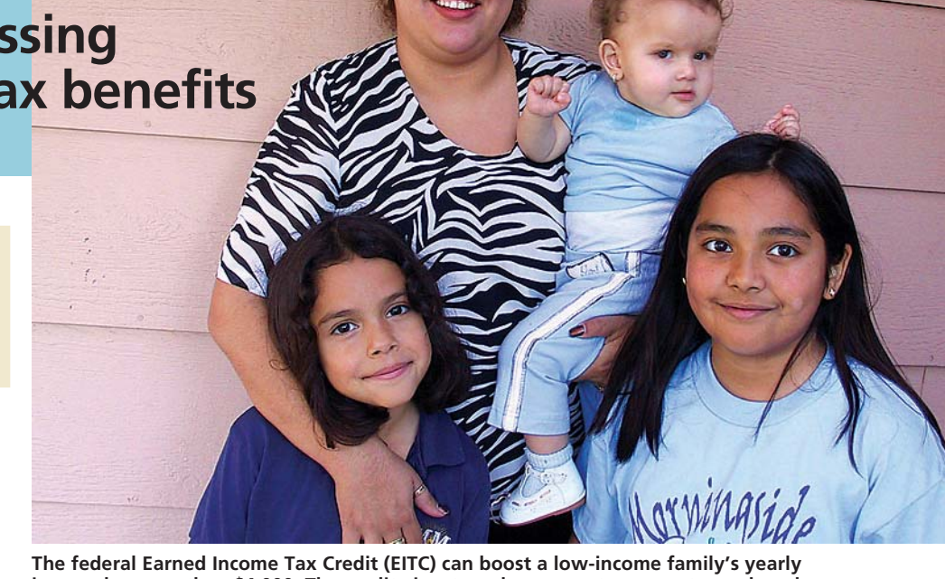
income by more than $4,000. The credit aims to reduce poverty, promote work and help families build assets.

he Earned Income Tax Credit largest and the most successful federal assistance program for low-income working families with children. When properly accessed, it can boost a family's yearly income by more than $4,000. More than 16 million U.S. lowincome families received $30 billion from this income supplement in tax year 2001. In 2001, the EITC elevated the families of 5 million children above the federal poverty line (Berube and Forman 2001). Implemented in 1975, the credit reduces poverty, promotes work, reduces income inequality, helps low-income families to build assets and encourages flexible resource utilization (Wirtz 2003; Cauthen 2002).