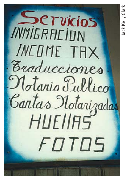
Tax-preparation services are often limited in rural communities.

When properly accessed, the federal Earned Income Tax Credit (EITC) can boost a family's yearly income by more than $4,000. A study in Kern and Madera counties indicated that many, perhaps most, qualified lowincome Latino families living in rural California communities may not be receiving the EITC. About 80% to 86% of eligible households nationwide receive the EITC, compared with about 36% of eligible California families in the study. The primary reason appears to be lack of accurate information and limited access to tax-preparation assistance. UC Cooperative Extension advisors and staff are well situated to provide information about the EITC.