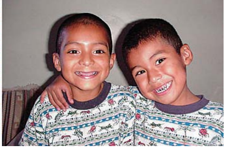
Only about 36% of the surveyed families who were eligible for the EITC applied for and received it in 1999. Outreach in rural communities is needed to ensure access to this important benefit for low-income workers and their children, above.