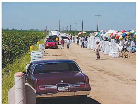
Subjects lived in the Central Valley towns of Madera (Madera County), left, Delano and Wasco (Kern County). About 57% of the mothers and 69% of their partners were working, such as in the grape fields of Wasco, right.

of the eligible families (between 58%and 64%) failed to take advantage of the income supplement. About 85% of eligible families benefit from the EITC nationally. It appears that our findings which indicate that significantly fewer eligible low-income Latino families living in rural California communities receive the credit — are supported by similar findings at the national level.