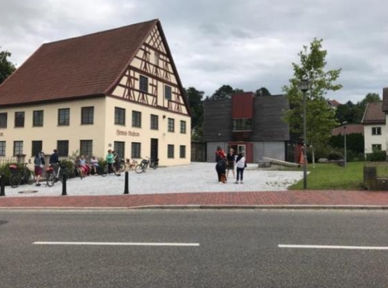
Fig 1 & 2: St. Martin's Parish Church (left) and The Heimat Museum (right).