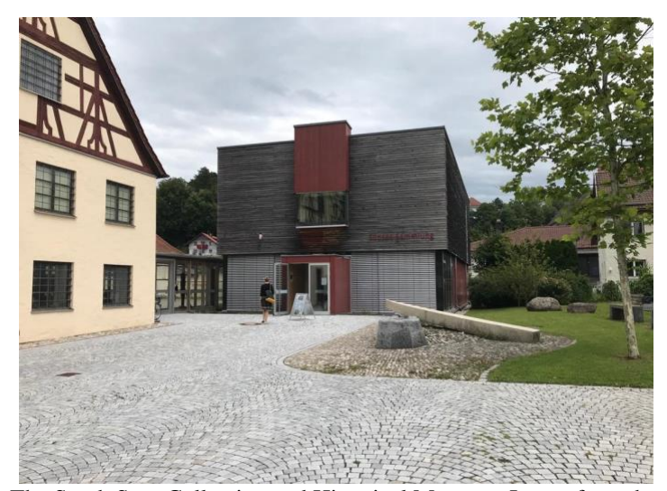
Fig. 3: The South Seas Collection and Historical Museum. Image from the author.

The first two, the St. Martin's Parish Church and the Heimat Museum, meet most expectations for the region; architecturally, symbolically, and in the narratives they promulgate about the town and its surroundings.