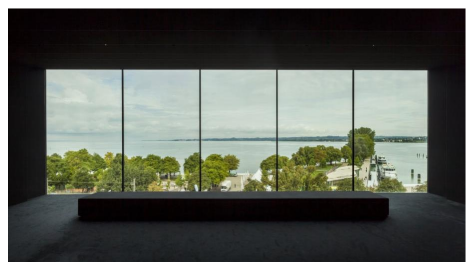
Fig. 6: View through the window of the Vorarlberg Museum.

In fact, one of its most stunning displays is a panoramic window (Fig. 6) that looks out at the lake and allows one to see the confluence of Austria, Germany, and Switzerland (as well as Lichtenstein with a little imagination). It also allows us to gaze across waters that have drawn people together from a wide variety of places for as long as people have been in what we now call Europe.