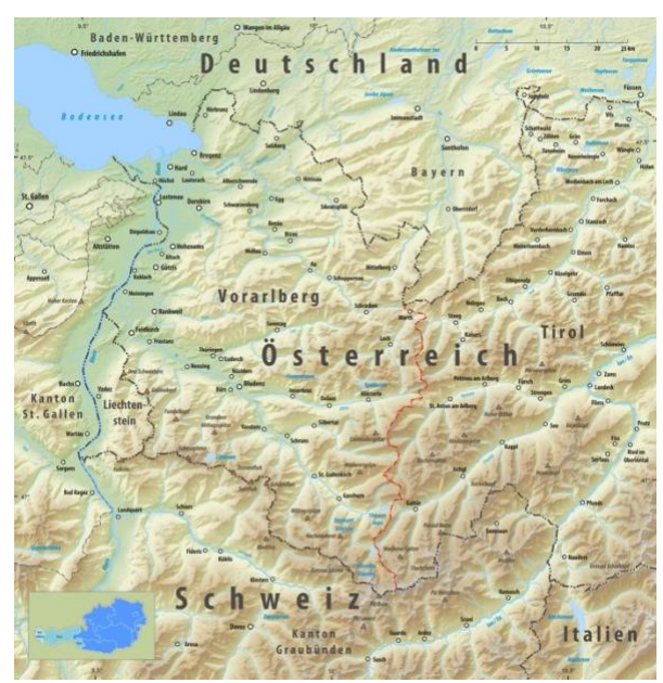
Fig. 5: Reliefkarte des Grenzverlaufs zwischen Tirol und Vorarlberg by <u>Tschubby</u>. Image can be accessed on Wikimedia Commons.

Rather than sitting at the center of the Bavarian state like Munich, Bregenz is located on the edge of the Bodensee, where Austria, Germany, Lichtenstein, and Switzerland come together.