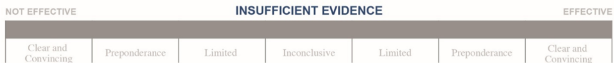
Figure 4. Findings Regarding Safety and Effectiveness of Pharmacists’ Prescribing of Injectable PrEP

CHBRP did not find any research regarding safety and effectiveness of pharmacists’ prescribing of PEP.