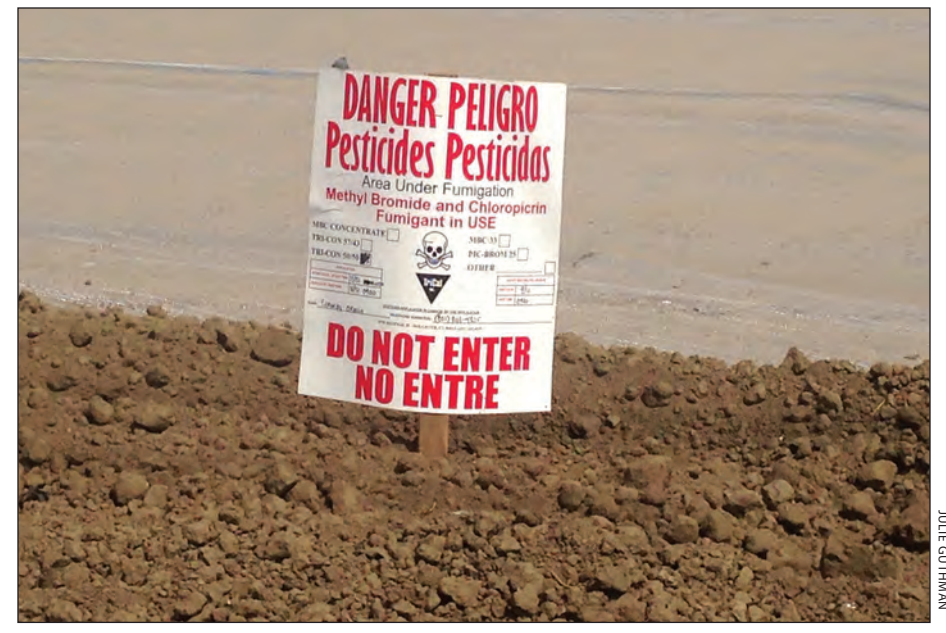
Warning sign at the edge of a fumigation.

Fieldworkers, by contrast, view the pesticides used at their worksites as