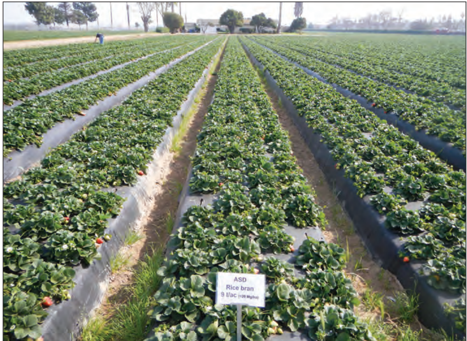
Anaerobic soil disinfestation (ASD) trial plots.

On the whole, conventional growers continue to opt for traditional chemical fumigants in lieu of implementing more agro-ecological and integrative approaches. Our review of pesticide use data from 2004 to 2011 shows that rather than scaling up their use of these alternative technologies, growers are generally choosing to increase their rates of chloropicrin application to compensate for the loss of methyl bromide. Growers are hesitant about scaling up the use of what they see as technologies still in the development rather than the commercial adoption phase, particularly in the context of challenges like lack of labor and drought that constrain their capac-