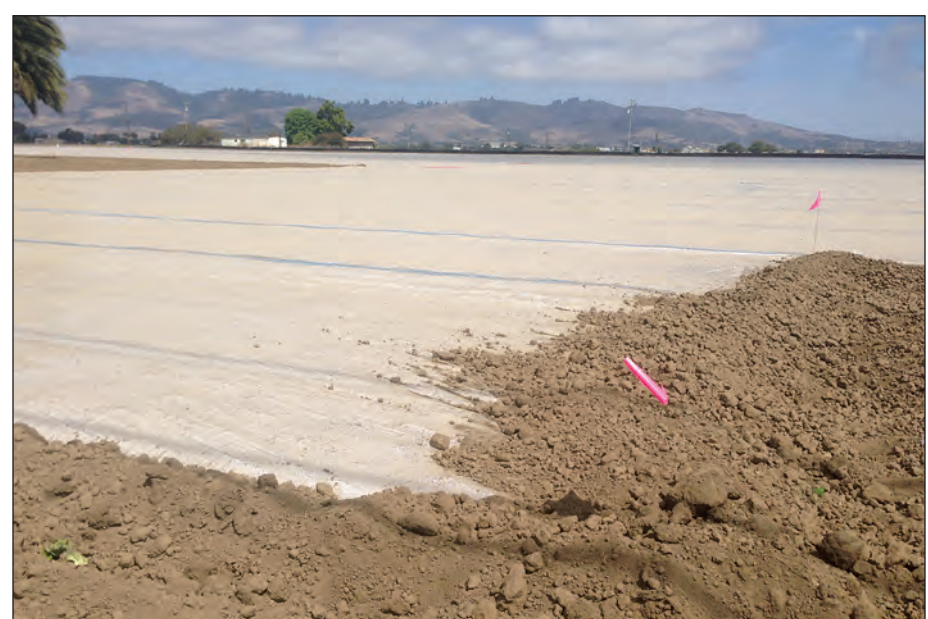
Dirt used to hold down protective tarps.

California strawberry growers appear to be experiencing an unusual labor shortage. The shortage owes to both heightened militarization of the border since 2001 and the pull of less arduous jobs in other crops and other industries. Growers widely complain about a lack of labor (Hertz and Zahner 2013; Tourte et al., 2016). One of the more interesting findings of this research is that the current agricultural labor shortage is much more concerning to strawberry growers than increasing regulations on soil