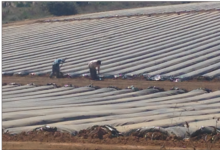
Workers maintaining a bed fumigation.

fumigants. Table 4 shows growers' responses to an interview question about their main challenges. When growers were asked to identify the main challenges to the viability of their operations, virtually every grower who gave a response mentioned the labor shortage, while comparatively few identified increasing regulatory burdens as one of their main challenges. This suggests that the labor shortage is a significantly more pressing concern for growers than increasingly strict mitigation measures or the potential phase out of soil fumigants. One grower's comments summarized the sentiments of several others: "The problem has nothing to do with fumigation. It's a labor shortage...there's not enough people to pick."