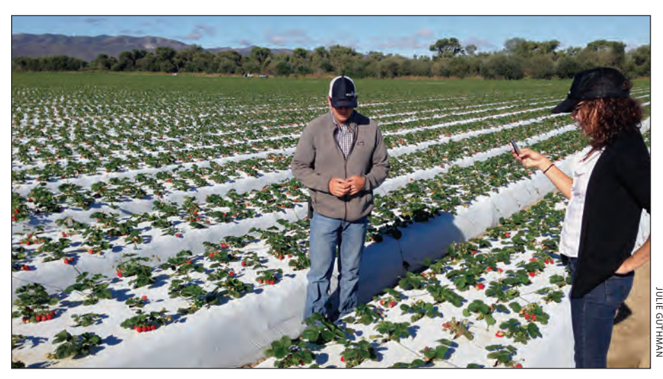
Interviewing a strawberry grower in Santa Barbara County.