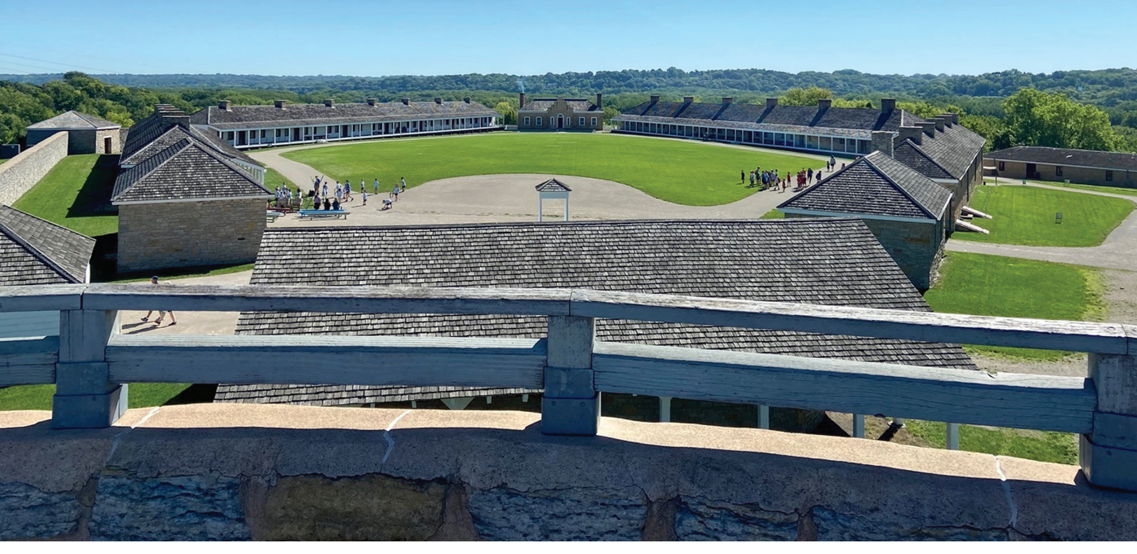
A view of the fort's interior taken from the top of the famed round tower. KATRINA M. PHILLIPS, AUGUST 2022

Lower Sioux Agency, which was established in Morton as a government agency in 1853 and the first site attacked by Dakota warriors in August of 1862. Fort Ridgely in Fairfax came under attack a few days later. The final related site is Traverse des Sioux, home to one of the 1851 treaty signings that led to the war.