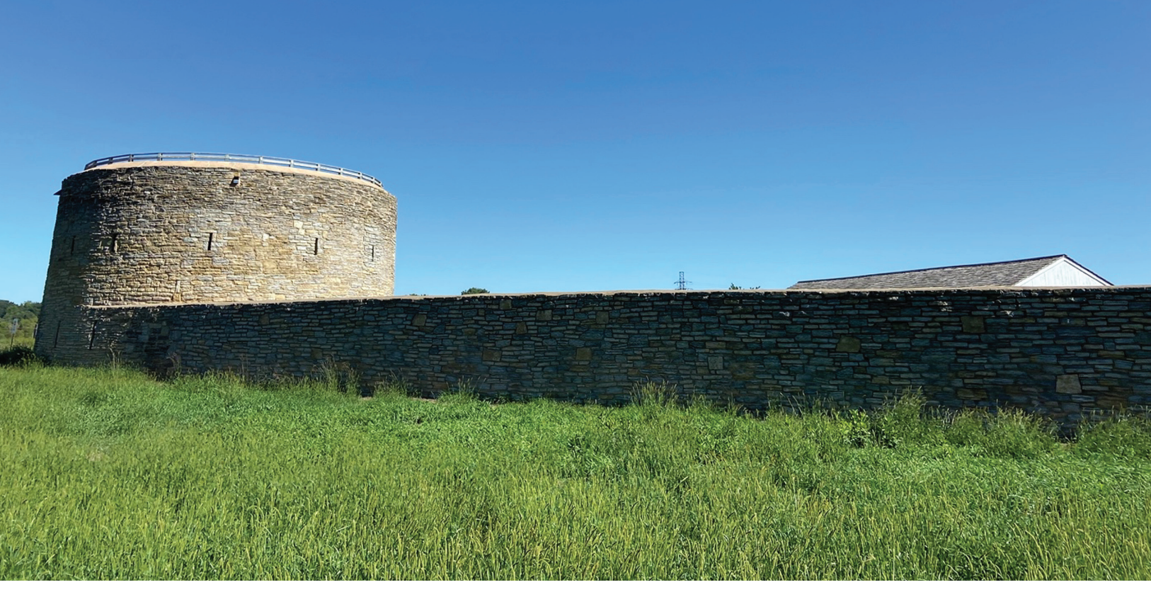
Historic Fort Snelling's famous round tower.

Parts of four volunteer regiments were forming at Fort Snelling, to serve the Union in the Civil War. Col. Henry Sibley redirected four companies to the combat zone in Minnesota. Other companies soon followed.