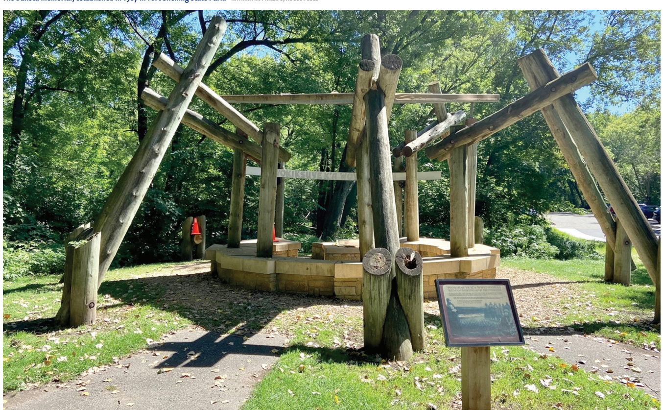
The Dakota Memorial, established in 1987 in Fort Snelling State Park.

There are no blacksmith demonstrations or artillery explanations. The rustling trees and birds are only matched by the cars humming along the bridge above us. There are no boisterous school groups or field trips here. It's just Leo