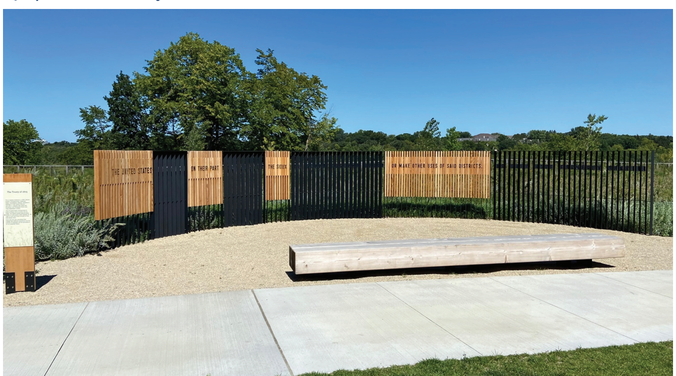
1805 Treaty installation at Historic Fort Snelling.