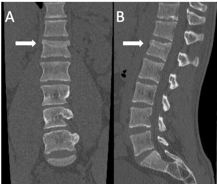
Figure 1. Chance fracture labeled A (antero-posterior view) and B (lateral view) involving body of the first lumbar vertebrae extending into the pedicle with probable pars interarticularis involvement without cord compression.

pain. Chance fractures, first described in 1948 by Chance, 4 are fractures caused by simultaneous flexion and distraction forces on the spinal column. The injury, most commonly to the T12-L2 spinal vertebrae, is a transverse fracture of the posterior spinous process, pedicles, and vertebral body. Due to their radiographic appearance, these are sometimes misdiagnosed as compression fractures. Most commonly seen in motor vehicle collisions with the advent of the lap seatbelt due to sudden stopping forces acting on the spine, they have decreased in incidence with the development of shoulder seatbelts. 5,6