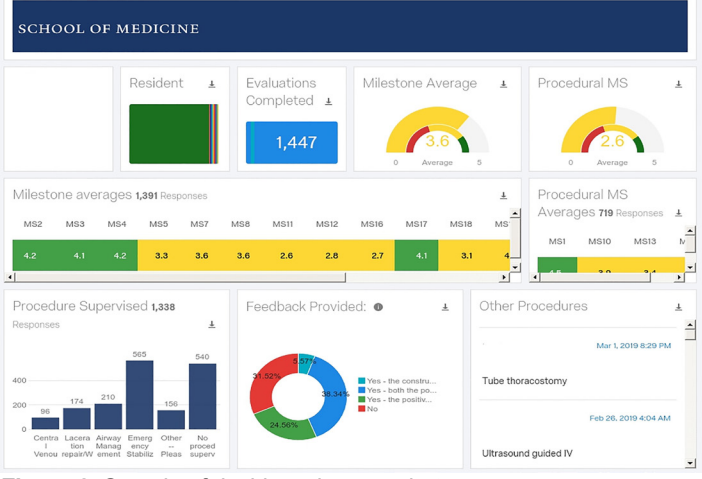
Figure 2. Sample of dashboard screenshot.

Figure 2 shows a visual representation of compilation of all feedback given for an individual or a group of residents over a time period that can be selected. An additional feature of the dashboard is the ability to include evaluation data from other sources, such as evaluations of residents by nurses. Those sources can use a different set of evaluation questions, as they do at our institution, as long as they use the Qualtrics survey tool. Access to the survey is granted via an e-mailed link to nurses. The use of this software was donated for the pilot of this project by Qualtrics.