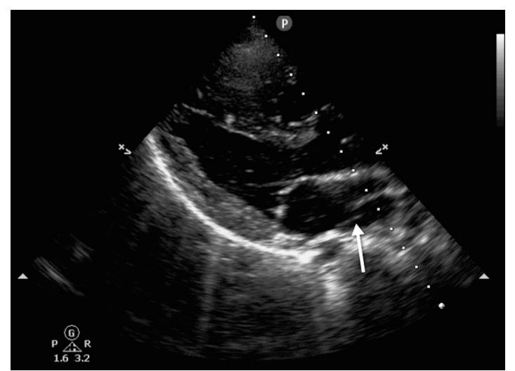
Figure 2. Parasternal long axis view showing double left atrium (arrow).