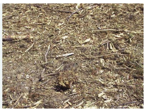
The study area in Tahoma, near Lake Tahoe, left , before and, center , after mastication treatment; right , the masticator grinds forest material into hand-sized chunks.

Soil compaction. Measurements were taken in late June 2004, when sufficient soil moisture was present for an accurate test of potential compaction. A cone penetrometer was used to measure resistance to force in pressure units as an index of soil compaction. A Spectrum Fieldscout SC 900 soil cone penetrometer (0.5-inch diameter [1.3 centimeters] and 30° angle) with a data logger was used to measure resistance to a depth of 18 inches (46 centimeters). Recordings of the force required to insert the penetrometer in kPa (psi) were taken at 1-inch (2.5-centimeter) intervals at a maximum insertion rate of 1 inch (2.5 centimeters) per second. Soil strength was measured in each of five points located randomly along the excavator tracks.