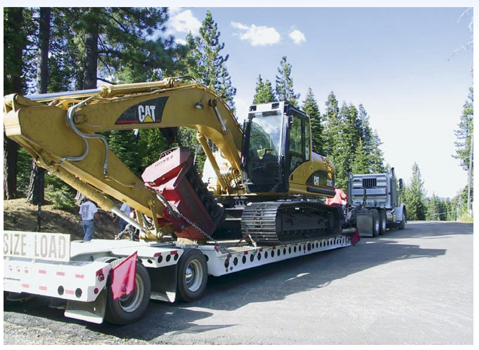
Mechanical mastication is a promising method for thinning overstocked forests. Above , a Fecon Bull Hog BH 80 masticator head is mounted to the boom of a Caterpillar 235 excavator.

Fires in these overstocked stands tend to be high-intensity "scouring" fires, which leave little intact understory and sterilize the soil. Loss of cover leaves bare soils extremely prone to erosion,