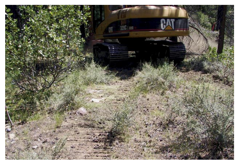
Above, runoff from masticated sites with granitic soils were much more likely to contain certain sizes of sediment particles than those from volcanic soils. Right , forests in the Tahoe Basin are severely compromised by the suppression of wildfires, disease and insect stress.

dispersed gradually over a large distance so that significant increases occur only when extreme distances are compared.