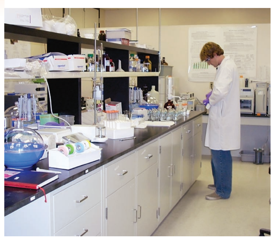
Laboratories at the Center for Environmental Research and Technology at UC Riverside focus on understanding and improving pretreatment, enzymatic hydrolysis and fermentation technologies for the biological conversion of cellulosic biomass into ethanol and other products.

ellulosic biomass, a structural material in plants that can be converted into ethanol, is the only large-scale sustainable resource for producing alternative liquid fuels that can be integrated with our existing transportation infrastructure. Cellulosic biomass includes agricultural residues such as corn stover (the corn plant minus kernels and roots), forestry residues such as sawdust and paper, yard waste from municipal solid waste, herbaceous plants such as switchgrass, and woody plants such as poplar trees. Because a dry ton of cellulosic biomass could provide about three times as much energy as a barrel of petroleum, cellulosic biomass would be worth about $200 per dry ton when crude oil sells at $65 per barrel. It can be purchased for about a third of that amount. To utilize this abundant resource, we must develop low-cost tech-