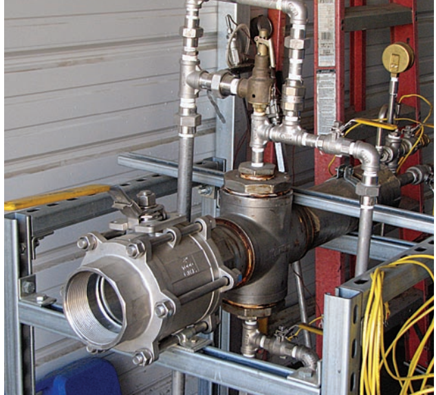
Researchers at UC Riverside invented this novel steam chamber, which heats up the reactors used to pretreat biomass more quickly and uniformly, and, conversely, cools down the material more rapidly than previous technology allowed.

Because it is corrosive, however, dilute sulfuric acid hydrolysis is still expensive, requiring costly construction materials for processing equipment. Its degradation products (such as furfural