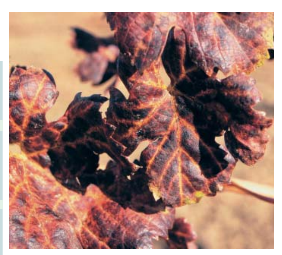
The authors determined that all four mealybug species can transmit grapevine leafroll disease via feeding. Above, 'Cabernet Franc' vines developed severe leafroll systems after infected longtailed mealybug fed on them.

and negative for other diseases on the indicators St. George, LN-33 and Kober 5BB. They were also retested by PCR for the other grapevine viruses.