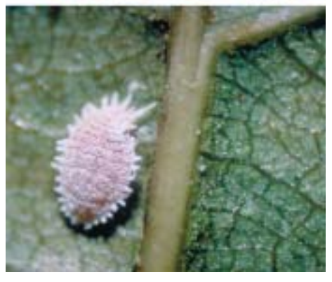
Four species of mealybug that are commonly found in California vineyards were selected for experiments on transmission of leafroll diseases: top to bottom, longtailed mealybug (female) and nymph with long, taillike filaments; obscure mealybug; grape mealybug, which is commonly found on grape berries, as shown; and citrus mealybug, with characteristic short, wedge-shaped