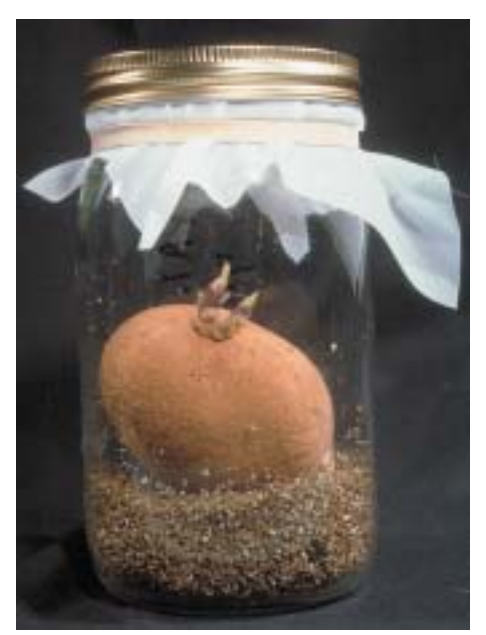
Most mealybug cultures were maintained on sprouted, organic potatoes in glass mason jars with silk-screen fabric covers.

Reference sources of leafroll and other grape virus diseases were established in the UC Davis grapevine virus collection (Golino 1992). This collection is essential to our studies since many grape viruses cannot easily be purified,