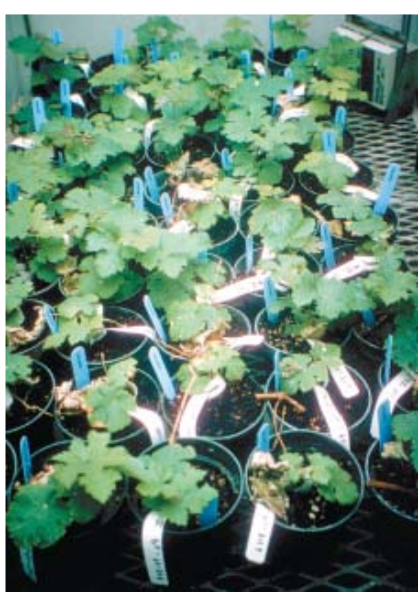
The authors developed a unique method for transferring mealybugs, which involved placing leaf cuttings from virus-infected plants onto healthy 'Cabernet Franc' plants so that insects were not harmed by direct handling.

Dormant, healthy cuttings of Cabernet Franc were used for GLRaV