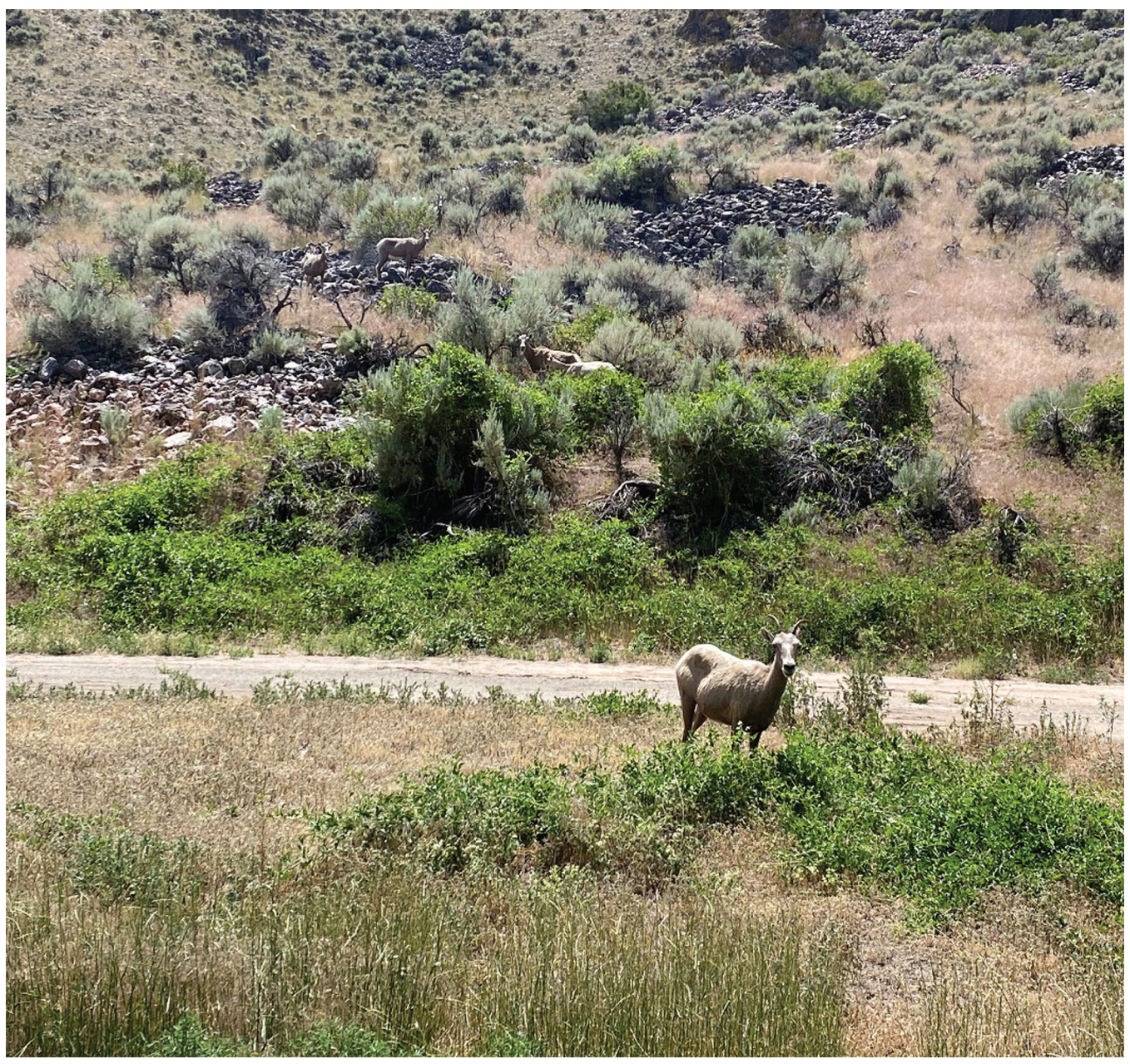
Wild bighorn sheep near Challis, Idaho, 2022