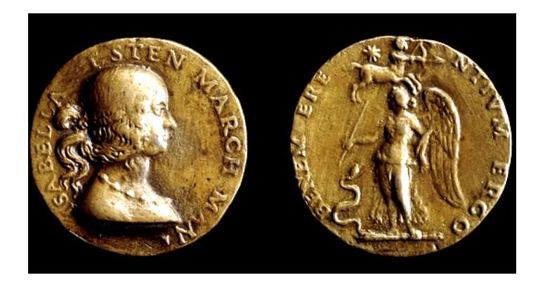
Fig. 3. Gian Cristoforo Romano, Bronze Medal of Isabella d'Este , 1498, British Museum, London. Source: British Museum collection online, <u>http://culturalinstitute.britishmuseum.org/asset-viewer/cast-bronze-medal-of-isabella-d-este-marchioness-of-mantua-by-gian-cristoforo-romano/SwF8Y9ePJyAZGQ?hl=en, consulted June 30, 2016.</u>

also based on an earlier work, a lost cartoon by another artist.<sup>14</sup> One plausible theory is that this other work was one of the replicas of the famous cartoon of Isabella d'Este by Leonardo da Vinci, made in 1499 when she was twenty-five, which is now in the Louvre. The Marchesa, who famously complained of the boredom of sitting for painters, had ordered copies of Leonardo da Vinci's cartoon, which she circulated among her friends.<sup>15</sup> While making generous allowance for flattery, Titian's portrait agrees with earlier likenesses of Isabella, as seen in Gian Cristoforo Romano's medals (fig. 3) and Leonardo's cartoon (fig. 4). But what of her courtly dress and hairdo? To what degree does Isabella's costume in Titian's portrait reflect her contemporary and/or retrospective fashions?