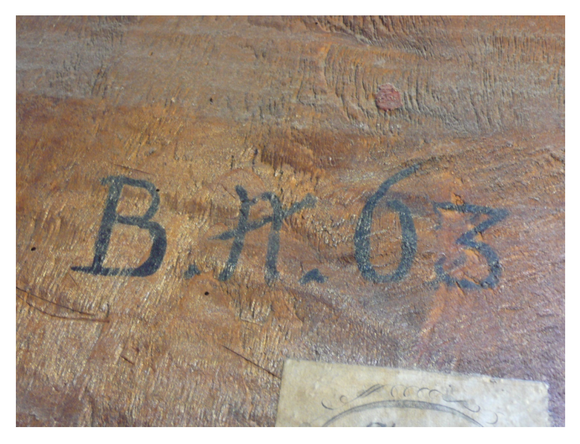
Fig. 31. Bartolomeo Veneto, Portrait of a Lady in a Green Dress , reverse, detail, Bortolina Plattis ink label, The Timken Museum of Art, San Diego.