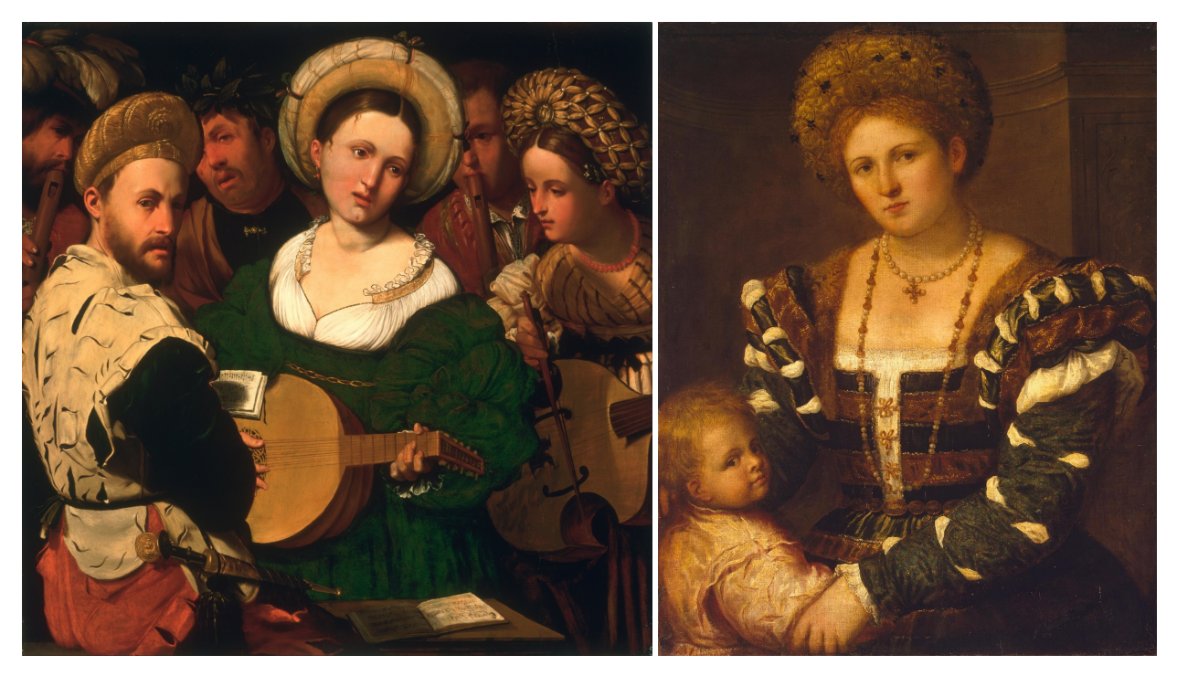
Fig. 10. Callisto Piazza, Musical Group , c.1525, Philadelphia Museum of Art.

Fig. 11. Paris Bordone, Portrait of a Woman with Her Son , c.1530, The State Hermitage Museum, St. Petersburg.