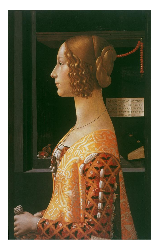
Fig. 23. Domenico Ghirlandaio, Portrait of Giovanni degli Albizzi Tornabuoni , 1489–90, Thyssen-Bornemisza Museum, Madrid.