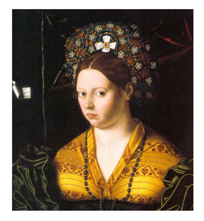
Fig. 19. Bartolomeo Veneto, Portrait of a Lady in Green Dress , detail.