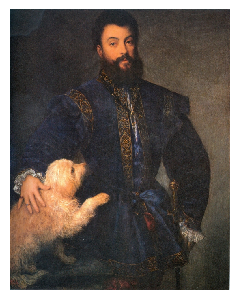
Fig. 27. Titian, Portrait of Federico II Gonzaga , c.1530–40, Museo del Prado, Madrid.