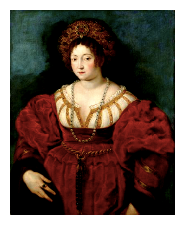
Fig. 26. Paul Rubens, Portrait of Isabella d'Este , c.1605, Kunsthistorisches Museum, Vienna.

Additionally, beads were a true obsession for Isabella and Federico.<sup>63</sup> Isabella and Federico used rosaries and paternosters as adornments, establishing contemporary fashion. For instance, in Titian's Portrait of Federico II Gonzaga (c.1530–1540) (fig. 27), a rosary of blue lapis is depicted around Federico's neck, while in Rubens's portrait, Isabella's paternosters are hung from her belt. Similarly, Margherita Paleologo displays her blue lapis rosary, gifted by Isabella,<sup>64</sup> attached to the belt (fig. 18). The type of necklace in the Timken portrait (fig. 19), also made of blue lapis beads divided by golden elements, is similar to that in Giulio Romano's picture and recalls those of Isabella and Federico.