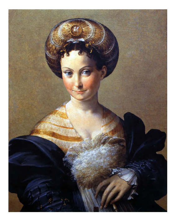
Fig. 13. Parmigianino, Turkish Slave , c.1533, Galleria Nazionale, Parma.

Fig. 12. Lorenzo Lotto, Portrait of a Woman Inspired by Lucrezia, c.1530–32, National Gallery of Art, London.