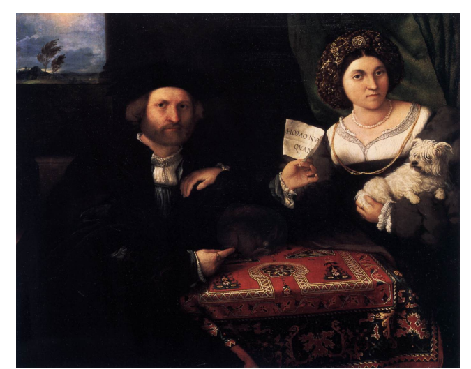
Fig. 9. Lorenzo Lotto, Portrait of a Married Couple , c.1524/25, The State Hermitage Museum, St. Petersburg.