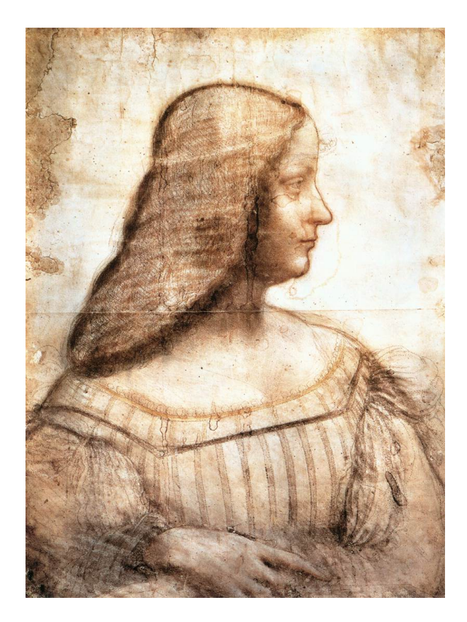
Fig. 4. Leonardo da Vinci, Portrait of Isabella d'Este , c.1500, Musée du Louvre, Paris.