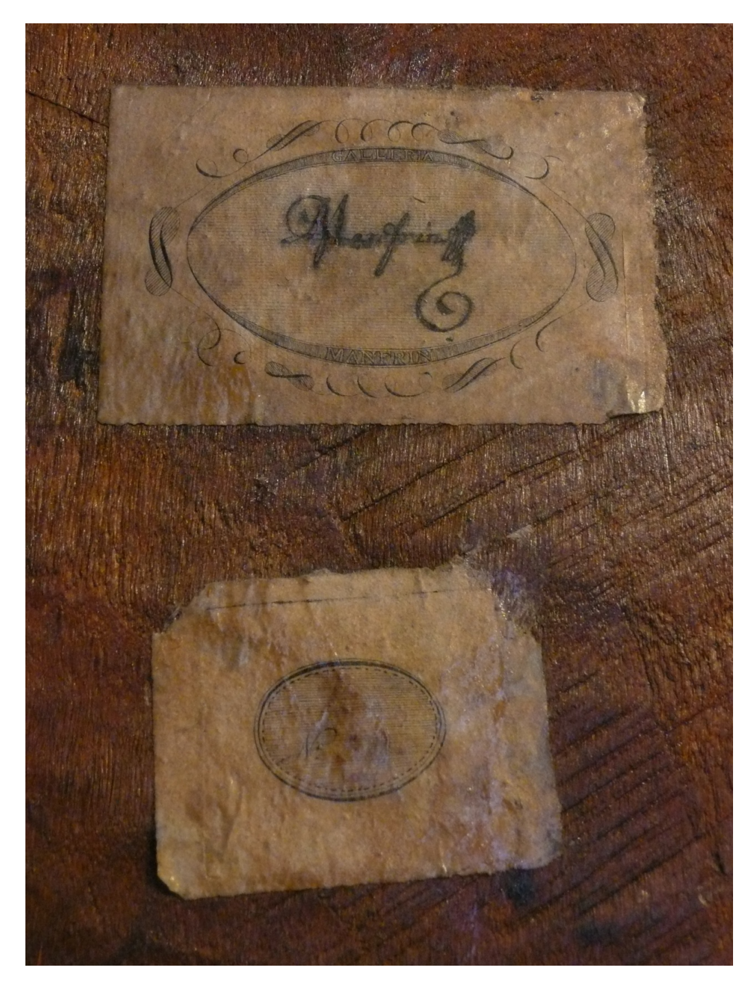
Fig. 30. Bartolomeo Veneto, Portrait of a Lady in a Green Dress , reverse, detail, Manfrin label, The Timken Museum of Art, San Diego.