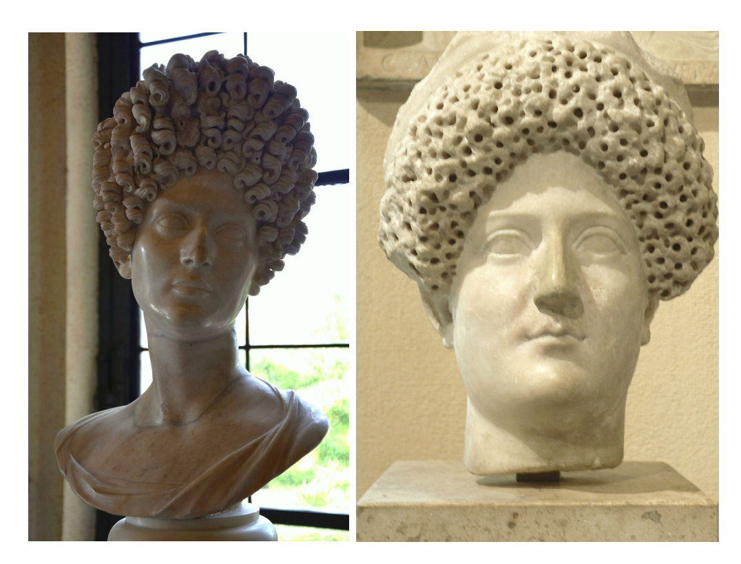
Fig. 17. Young Flavian Woman, c.120 AD, Museo Capitolino, Rome, Italy (Left). Source: Wikimedia Commons, photo by Carole Raddato, public domain,

https://commons.wikimedia.org/wiki/File:Portrait_of_a_woman_from_the_Flavian_period, between_AD_69_and_ AD_96,_Musei_Capitolini,_Rome_(12972527964).jpg, consulted June 30, 2016.