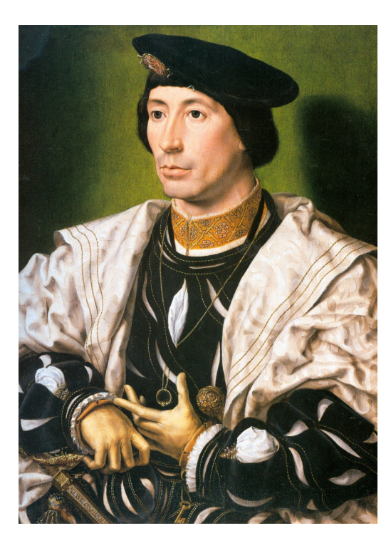
Fig. 24. Jan Gossaert, Portrait of a Man , c.1520s (?), Staatliche Museen Preussicher, Berlin.