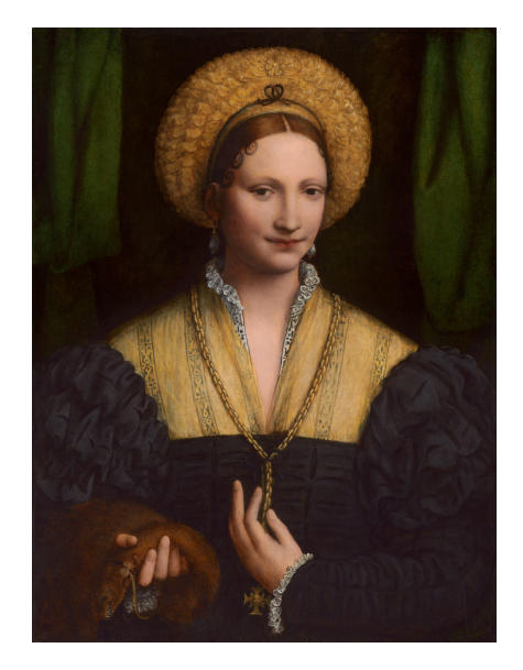
Fig. 8. Bernardino Luini, Portrait of a Lady , 1520/25, National Gallery of Art, Washington, DC.

Fig. 7. Lorenzo Lotto, Portrait of Messer Marsiglio Cassotti and His Wife Faustina, 1523, Museo del Prado, Madrid.