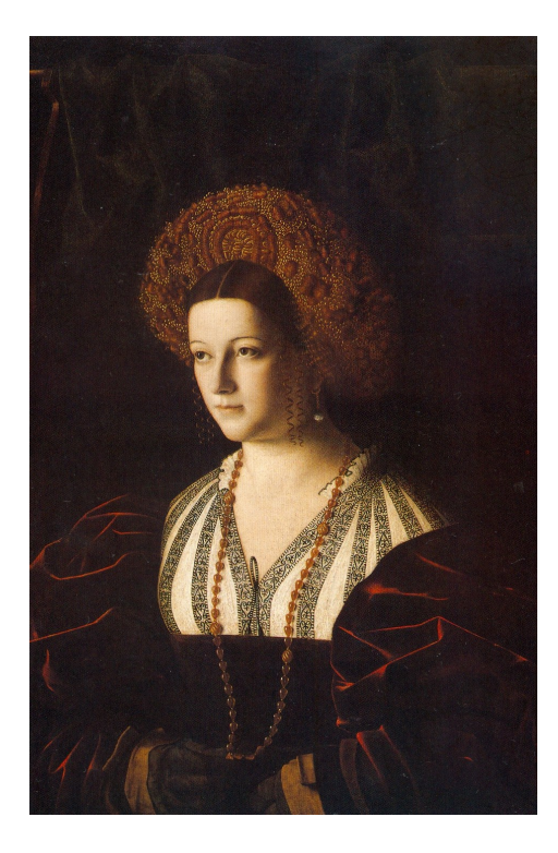
Fig. 20. Bartolomeo Veneto, Portrait of a Young Woman , c.1520–30, National Gallery of Canada, Ottawa.

Fig. 19. Bartolomeo Veneto, Portrait of a Lady in Green Dress , detail.