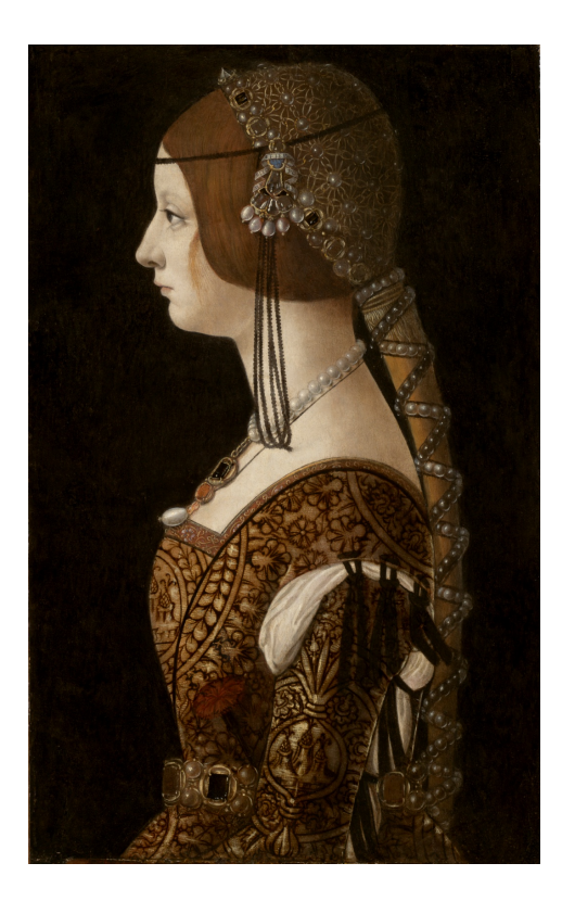
Fig. 21. Ambrogio de Predis, Portrait of Bianca Maria Sforza , c.1493, National Gallery of Art, Washington, DC.

Pope Clement VII supported Federico's case and, annulling his engagement with Giulia due to Giulia's unsuitability to the task of procreation, affirmed the validity of the Marchese's marriage contract with Maria on September 20. With the Pope's declaration in hand, Federico needed only to obtain the Emperor's consent to excuse himself from his engagement with Giulia. This would have been a merry conclusion for all, but Maria died suddenly on September 15, with no sign of illness, perhaps because she was poisoned as a result of the internal dynastic struggle. In view of the heartbreaking outcome of the much-desired marriage, could Anna have commissioned a portrait both to find consolation and to commemorate her daughter as a "d'Este" bride?