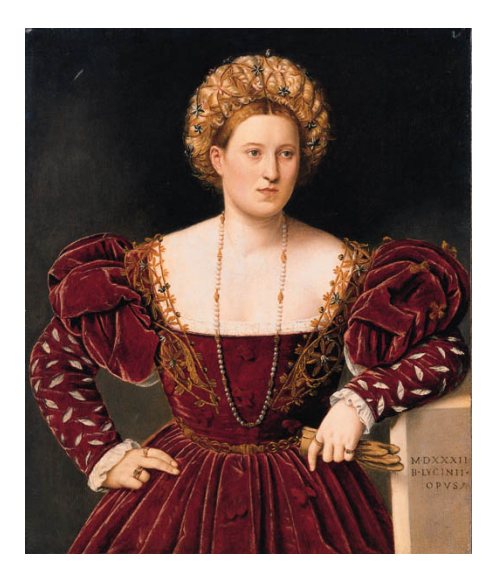
Fig. 14. Bernardino Licinio, Portrait of a Woman in Red, 1533, Dresden State Art Collections.