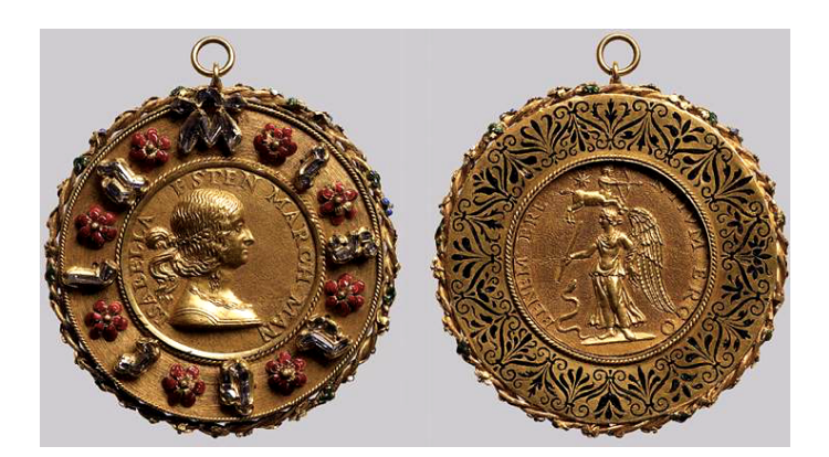
Gian Cristoforo Romano, Gold Medal of Isabella d'Este , 1498, Kunsthistorisches Museum, Vienna.