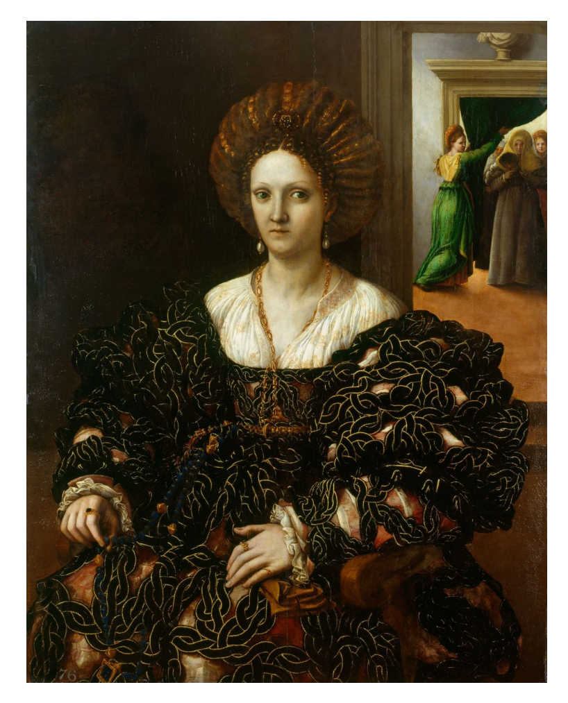
Fig. 18. Giulio Romano, Portrait of a Lady, Margherita Paleologo (?), c.1531 (?), Royal Collection, Windsor.

Fortunately, a painting by Giulio Romano of a lady wearing the Mantuan cap (fig. 18), now in the Collection of Her Majesty the Queen of England, was recently identified as the wedding portrait of Margherita Paleologo.<sup>45</sup>