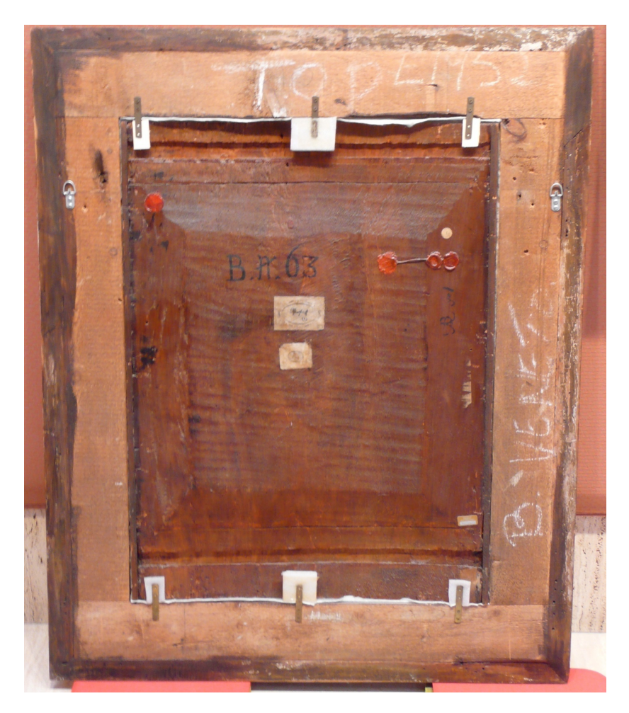
Fig. 28. Bartolomeo Veneto, Portrait of a Lady in a Green Dress, reverse, The Timken Museum of Art, San Diego.

letters, these archival inventories do not include information about paintings' provenance, making it difficult to trace the ownership of the Bartolomeo work prior to the Manfrin collection. Further identification may be assisted in the future by extant seals and collection stamps on the reverse of the painting (fig. 28).<sup>78</sup> Of particular importance is a small seal of dark brown wax impressed by a signet ring, dating back to the sixteenth-seventeenth centuries and bearing a monogram with a cross, a crown, and two letters, "G" and "V," placed symmetrically on each side of the cross (fig. 29). It is very difficult to connect this monogram with a particular owner, as only a few monograms or seals associated with paintings have been published and interpreted. Could the letters "G" and "V" signify a personal device of one of the Gonzaga collectors?<sup>79</sup> The signet seal requires further research before we can know for certain the whereabouts of the painting prior to its becoming part of the Manfrin collection.