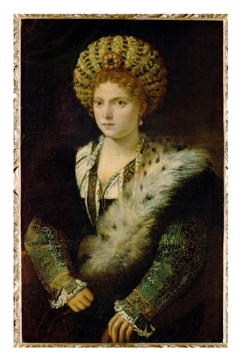
Fig. 2. Titian, Portrait of Isabella d'Este , 1534–36, Kunsthistorisches Museum, Vienna.

fashion among most powerful ruling houses in North Italy.<sup>10</sup> The lady wears an Eastern-style, shimmering golden shoulder-covering ( bavero ) with a deep neckline, made from silk damask embroidered with a royal pomegranate motif. A long necklace of blue lapis that matches the color of her eyes, a violet-colored sash with a large ribbon decorating her waist, and brown falconing gloves complete an elaborate dress well-suited to a high-born princess.