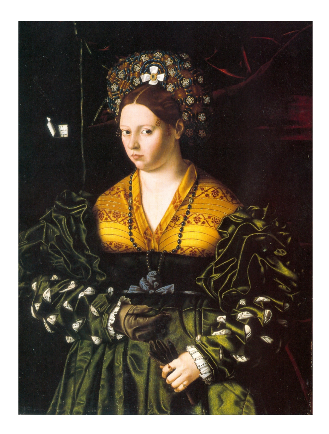
Fig. 1. Bartolomeo Veneto, Portrait of a Lady in a Green Dress , 1530, The Timken Museum of Art, San Diego.