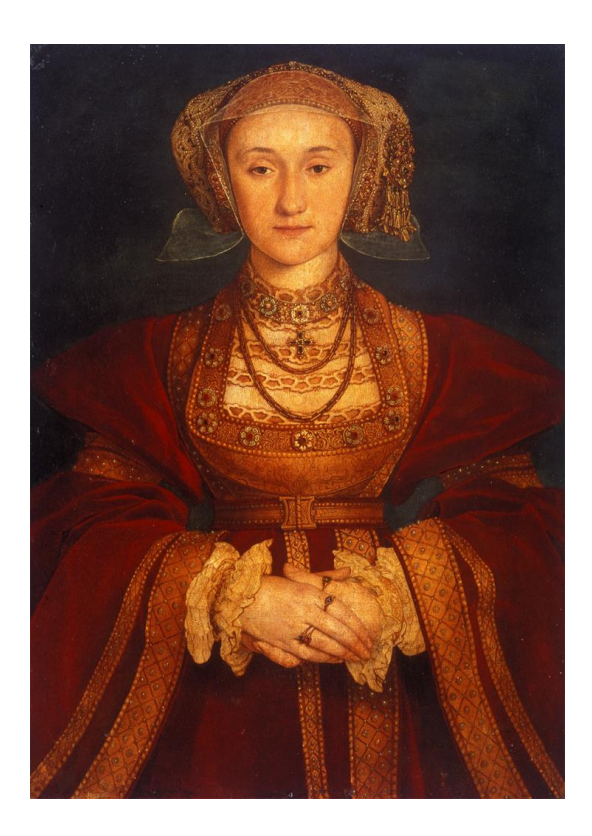
Fig. 22. Hans Holbein the Younger, Portrait of Anne Cleves, 1539, Musée du Louvre, Paris.