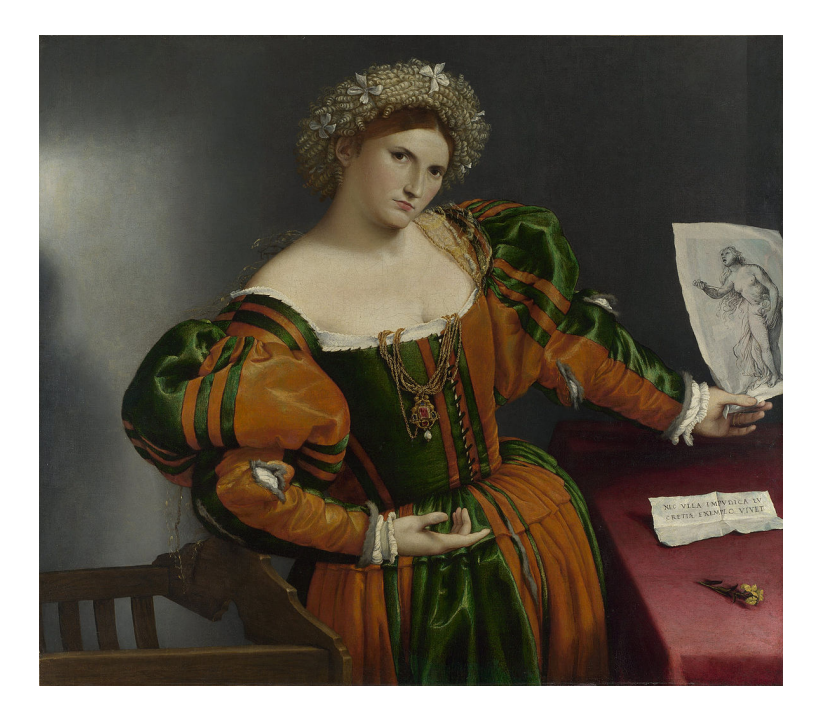
Fig. 12. Lorenzo Lotto, Portrait of a Woman Inspired by Lucrezia, c.1530–32, National Gallery of Art, London.