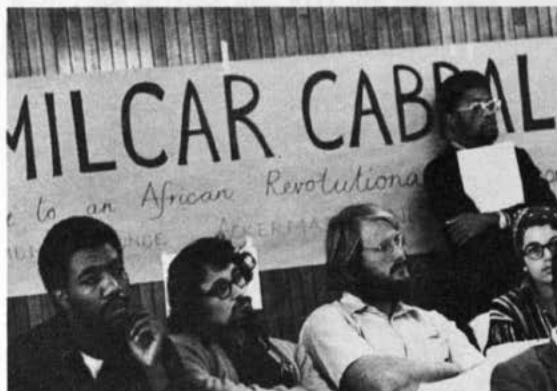
Cabral Memorial Rally at UCLA.