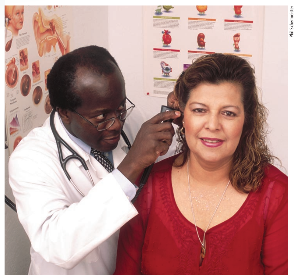
Type 2 diabetes is being diagnosed more frequently in Latinos, in whom serious complications such as amputation are more common than in non-Latino white patients.

T the United States, diabetes af-Fects an estimated 23.6 million people, most of whom do not achieve optimal control of their blood glucose levels (Valitutto 2008). Fueled by the obesity epidemic, this disease is expected to affect 48.3 million people by 2050 (Narayan et al. 2006). Globally, the number of people with diabetes is projected to double over the next 30 years, with much of the increase expected to occur in developing countries (Chaturvedi 2007). We review trends in type 2 diabetes and provide a perspective on the implications for occupational health and safety programs targeting farmworker populations. We also discuss ways that outreach and research programs of the University of California and UC Cooperative Extension can help to reduce the burden of diabetes.