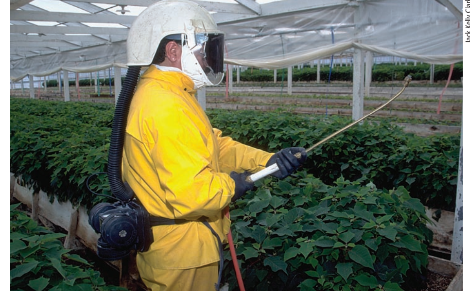
While limited research has examined occupational factors that contribute to the risk of diabetes, there is evidence of an association with environmental exposure to pesticides. Above , protective gear helps to protect a farmworker from pesticide exposure in a San Diego County nursery.