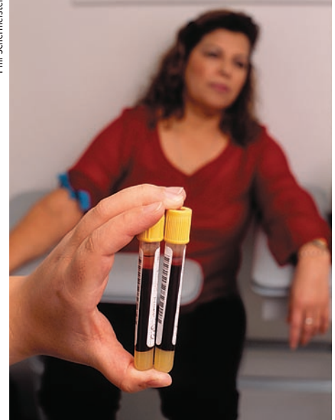
Nutrition therapy, exercise and medication can help to manage type 2 diabetes, and ongoing medical attention is critical.

ing in 10% to 40% of uncontrolled diabetes cases already having developed complications by the time of diagnosis.