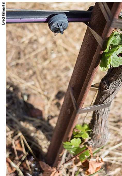
Drip irrigation emitter using recycled water from the Napa Sanitation District.

In addition to the water sampling described above, we collected soil samples in September 2005 from a vineyard that had been drip-irrigated with NSD recycled water for eight seasons (1997 to 2005). Soil samples were collected Sept. 15, 2005, at two depths. The grower typically