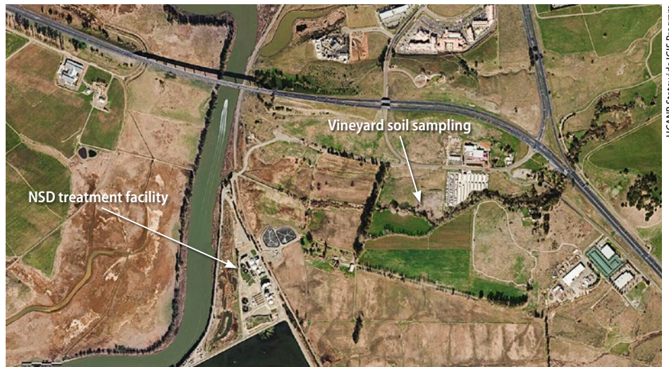
Aerial view of the Napa Sanitation District's recycled water use area and the location of the soil sampling site. The use of treated municipal wastewater for irrigating crops has increased in California in the past 10 years and is expected to expand exponentially in the next few decades.

For recycled water to be a benefit to grape growers, it needs to be suitable for vineyard irrigation and there must be no problems with it (such as high salinity or toxic constituents) that could affect the vines or soil; and growers must be confident about its quality and the effects. In 2004–2005, NSD gave UC a grant requesting a feasibility study. For this study, samples of NSD recycled water were collected