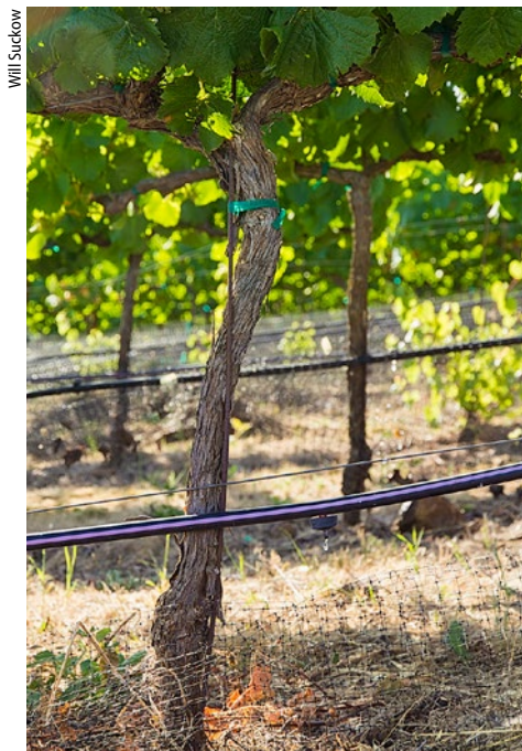
Malbec vines at Trinitas Cellars vineyard in Napa.

Some soils in Napa County and parts of the North Coast of California are derived from serpentine parent material, leading to high Mg concentrations (in relationship to Ca), which can affect plant nutrition and reduce plant growth. A review of research studies indicates that plant growth reductions may occur in some plants when the concentration of Mg in soil solution substantially exceeds the Ca concentration (Grattan