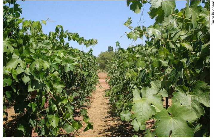
Vines that receive fertilizer applications balanced with their needs, left , show no excess vigor. Vines given too much N produce too much vegetation, right , which can lead to reduced yield and lowered wine quality. The N content of recycled water must be taken into account to keep vines in balance.

and processes of vines, and also of fermentative microorganisms, which can influence quality components in the grape and thus the wine (Bell and Henschke 2008).