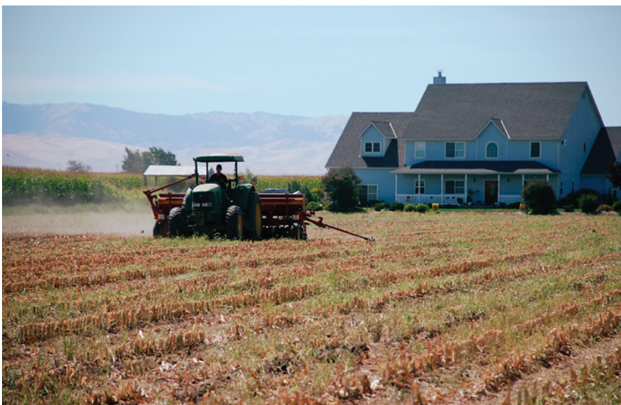
A time interval of 6 to 8 weeks, coupled with adequate irrigation or precipitation, can facilitate the leaching of allelochemicals from the soil, making it safe to plant the vegetables studied.