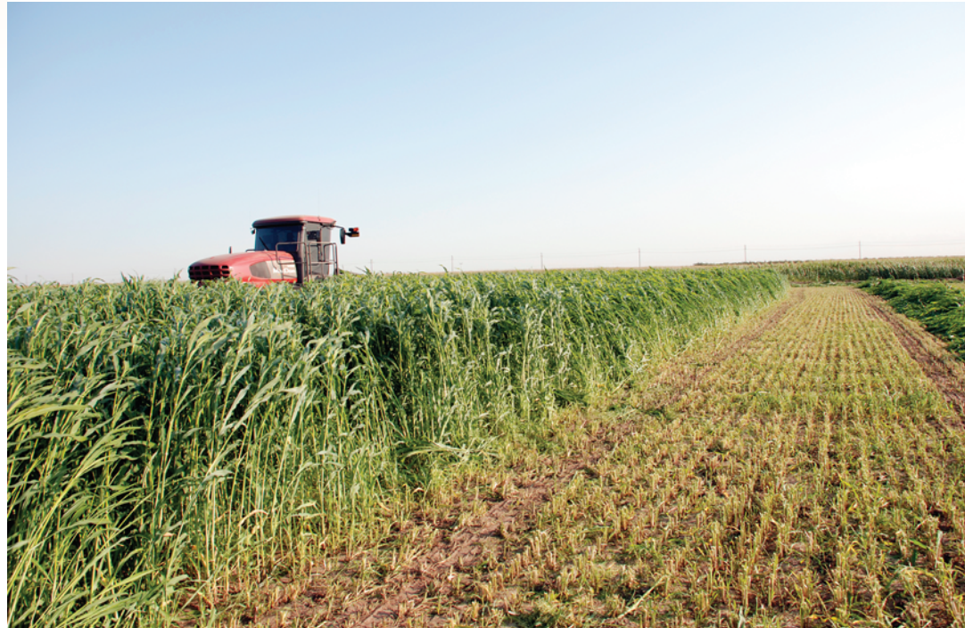
Sudex is a hybrid of sorghum and sudangrass that is grown extensively as a cover crop in the Imperial and San Joaquin valleys to reduce erosion, improve soil structure and suppress weeds. It appears to have allelopathic properties that can damage subsequent vegetable transplants. Above, sudex silage is harvested in Turlock.

Sudex, a sorghum-sudangrass hybrid, is grown as a cover crop in California to reduce erosion, improve soil structure and suppress weeds. Additionally, sudex ( Sorghum bicolor [L.] Moench × S. sudanense [P.] Staph.) serves as a source of green manure (Weston et al. 1989), forage and silage (Chaudhry et al. 1997). Sorghum-sudangrass hybrids, including sudex and collectively known as sudan, are cultivated extensively in the Imperial and San Joaquin valleys. In Imperial County, over 55,000 acres of sudan hay is produced, while in the San Joaquin