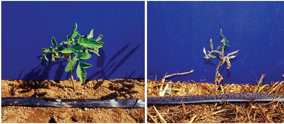
Tomatoes planted too soon after a sudex cover crop can suffer from mortality or yield reductions. Left , a healthy control tomato was planted in fallow soil. Right , a tomato transplant set 20 days after sudex roots and shoots were cut is stunted and shows evidence of necrosis (dead tissue) on the leaf margins.

killed sudex crop during the summer. We also examined the impact of sudex on broccoli ( Brassica oleracea var. botrytis L. 'Marathon') and lettuce ( Lactuca sativa L. 'Cowboy') crops that would likely be transplanted in the fall following a summer sudex crop.