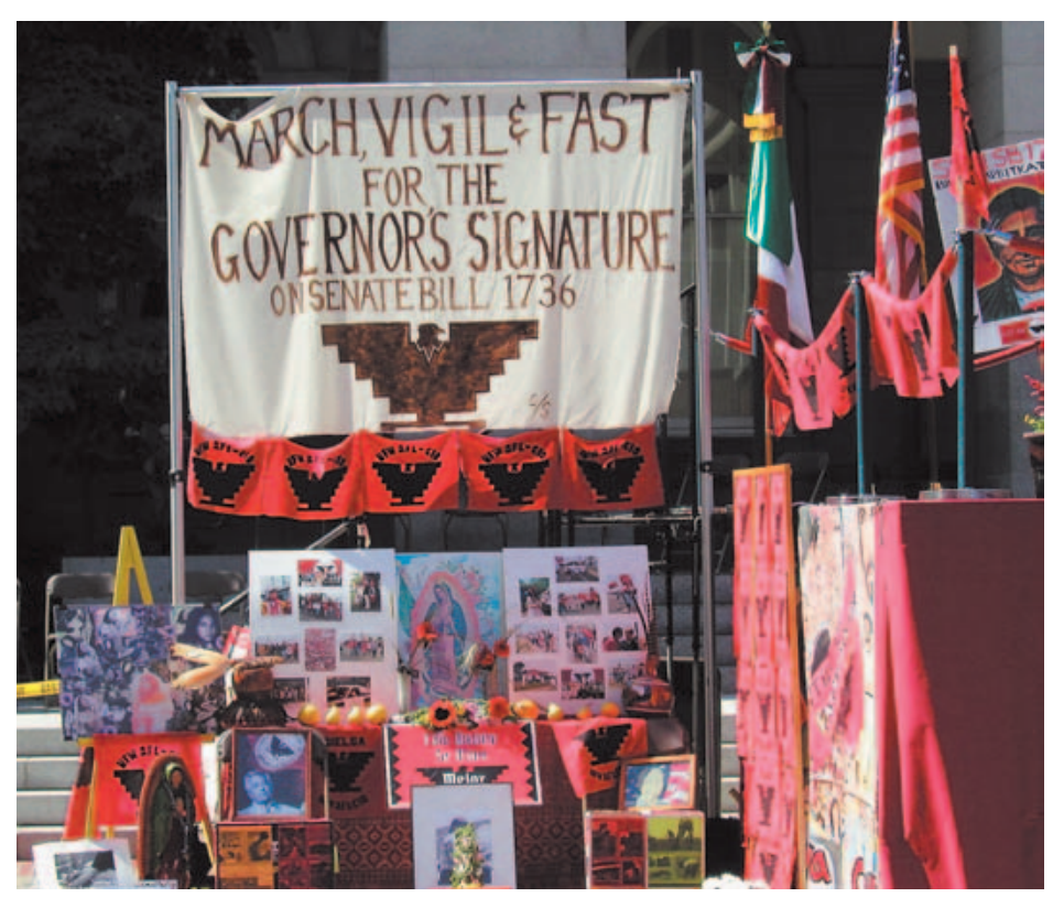
The new mandatory mediation law changes the rules for collective bargaining, allowing a mediator to impose an agreement if collective bargaining does not lead to a contract. Unions hope the law will usher in a new era for farm labor.

The purpose of collective bargaining is to allow the parties closest to the workplace — employers and unions to establish fair wages and benefits in private negotiations, with both sides using the economic leverage under government-set rules. A cardinal principle of collective bargaining has been that the government does not determine the content of the agreements negotiated, only the procedures under which they are negotiated — like referees who ensure that the game is played by the rules but do not follow the score. The make-whole remedy for bad-faith