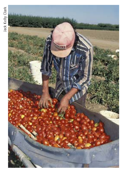
California has an average of 450,000 agricultural employees working for 23,000 farm employers. The percentage of farmworkers represented by unions has declined significantly since the 1970s.