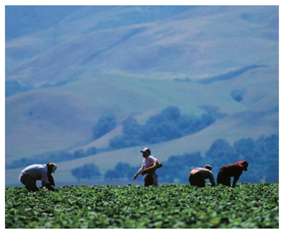
Under the ALRA's make-whole remedy, the Agricultural Labor Relations Board can order employers to pay wages and benefits to workers if they fail to bargain in good faith with unions. While the ALRB has ordered $34 million in make-whole payments for bad-faith bargaining, only $4.5 million has been distributed to workers.

Furthermore, these calculations are complicated by several factors. First, there can be delays in determining how much an employer owes because of a 1987 Court of Appeals ruling. After the ALRB determines there was bad-faith bargaining, the ruling allows employers to present evidence that even with good-faith bargaining there would not have been an agreement negotiated with higher wages, and thus no make whole is owed (Dal Porto and Sons v. ALRB, 191 Cal. App. 3d 1195 [1987]).