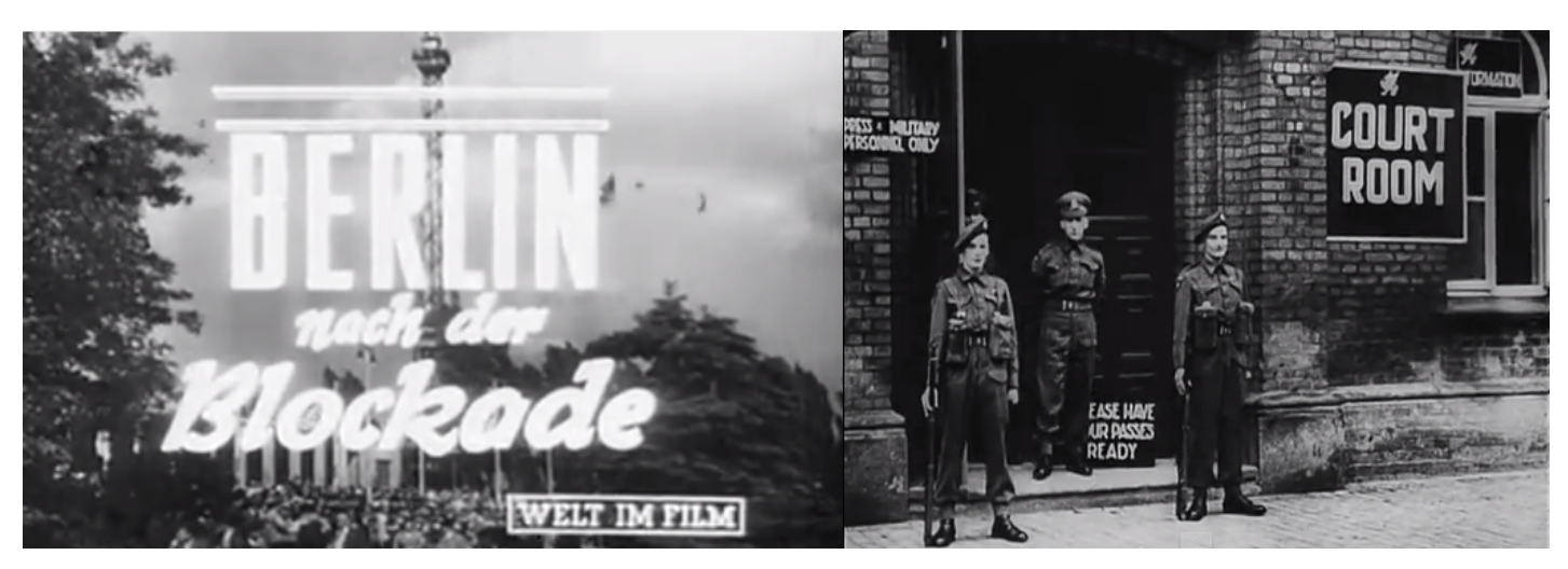
Newsreels: Fighting "Intellectual Malnutrition"